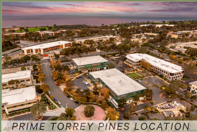
PRIME TORREY PINES LOCATION