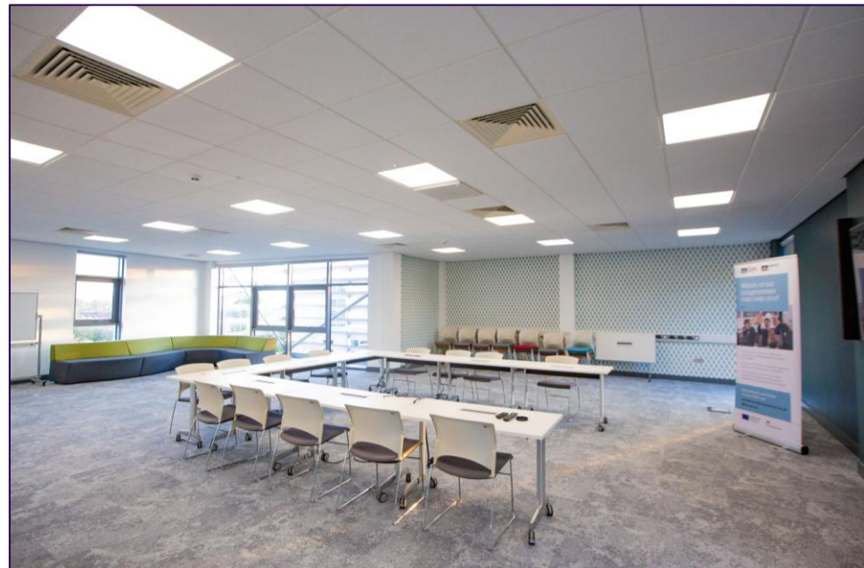
As currently fitted out.