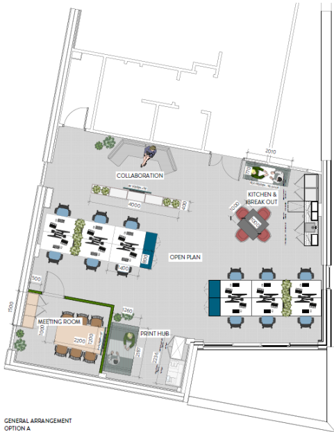
GENERAL ARRANGEMENT OPTION A scale 1:50