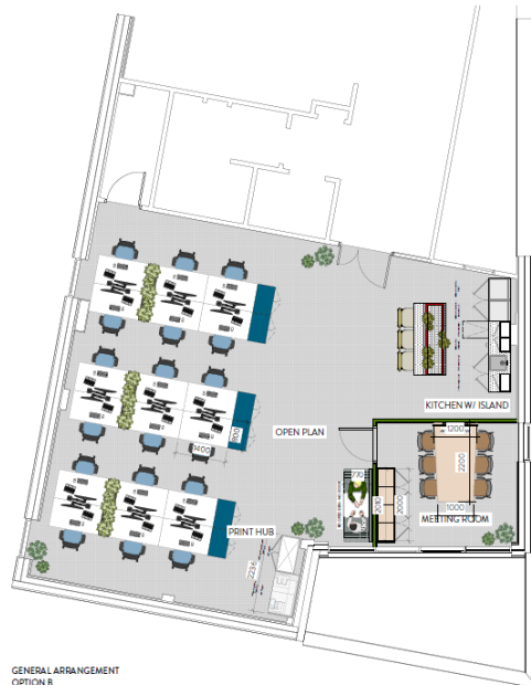
GENERAL ARRANGEMENT OPTION B scale 1:50