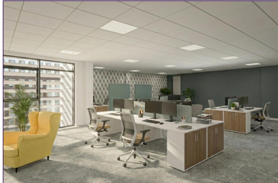
Indicative CGI image.