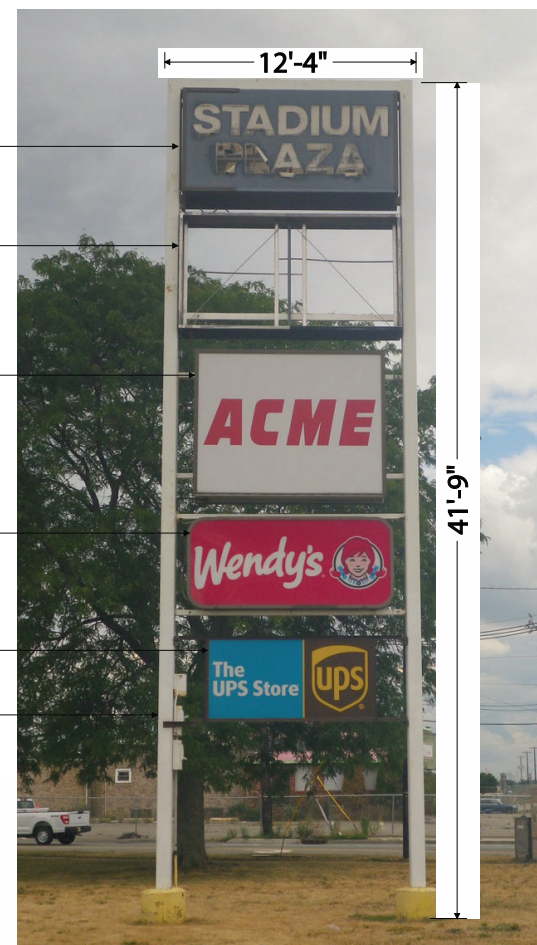
Existing 246sq.ft. pylon sign to be removed