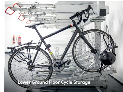
Lower Ground Floor Cycle Storage