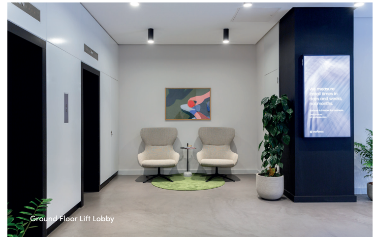
Ground Floor Lift Lobby