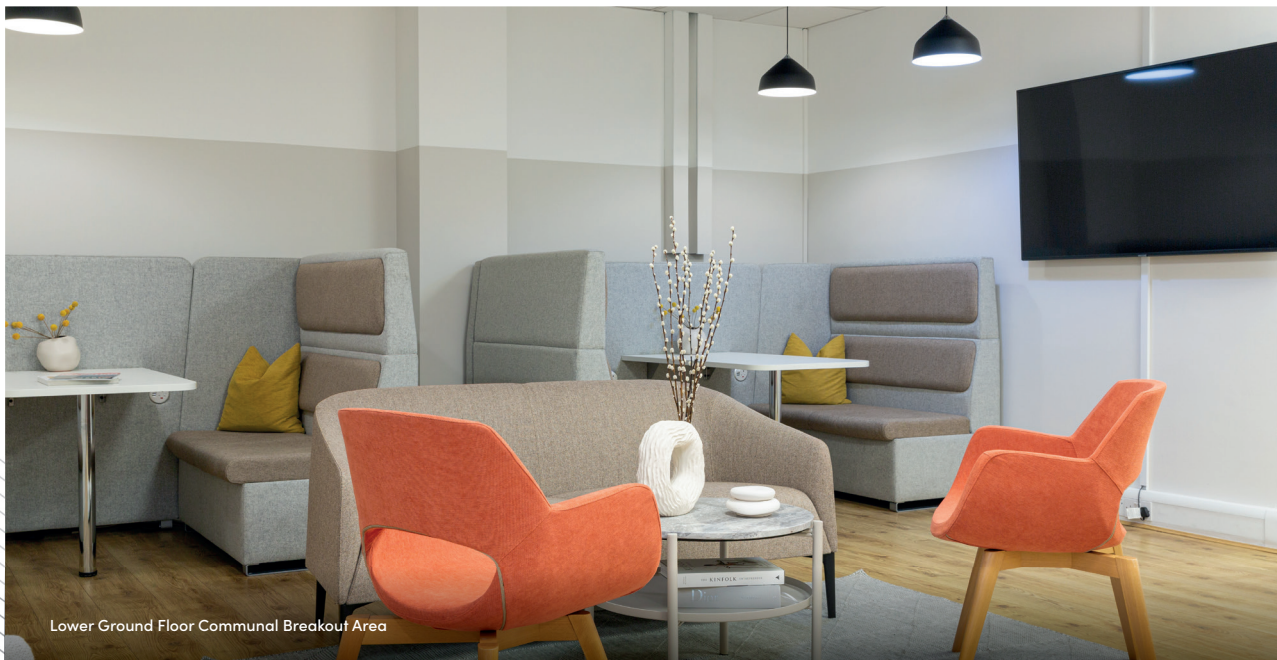
Lower Ground Floor Communal Breakout Area