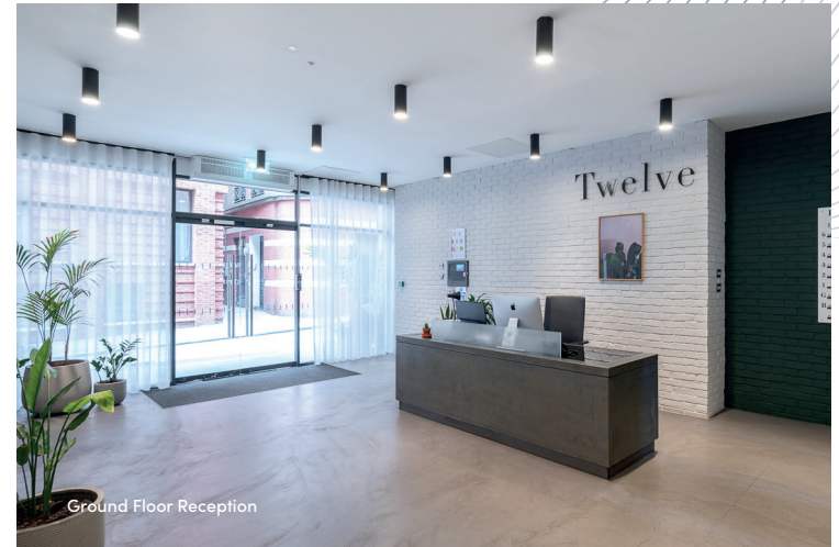
Ground Floor Reception