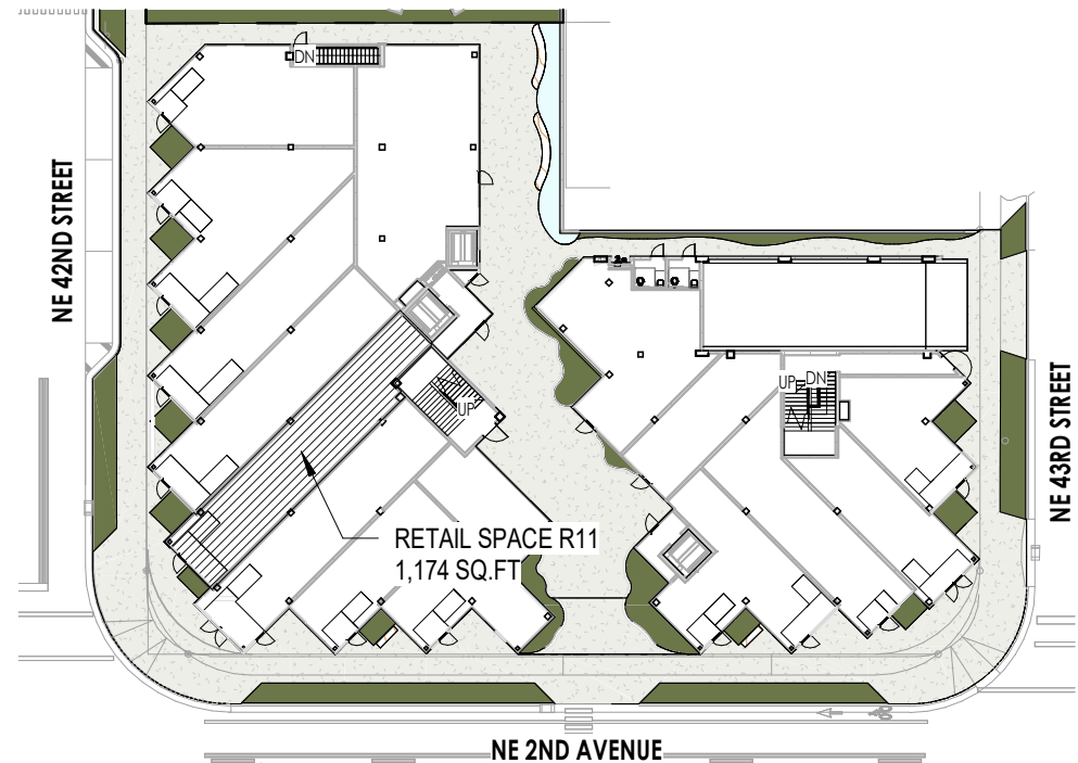
1 KEY PLAN SCALE: 1" = 50'-0"