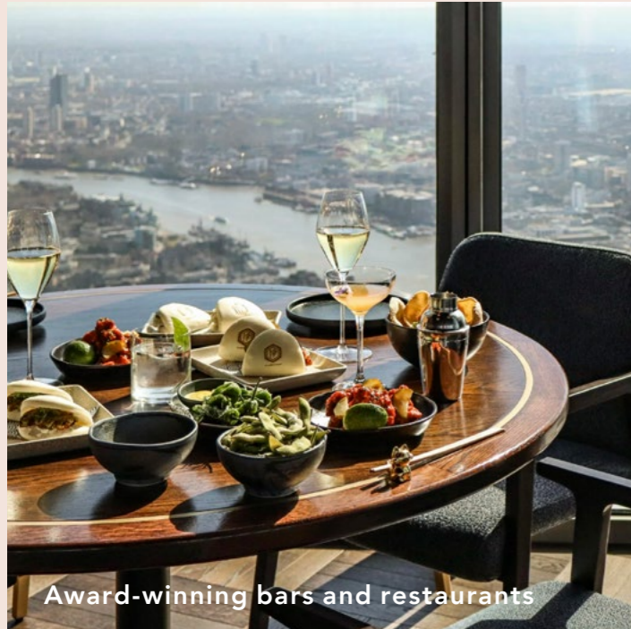
Award-winning bars and restaurants