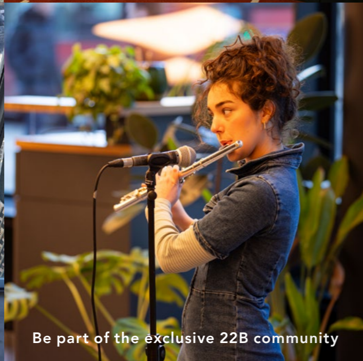
Be part of the exclusive 22B community