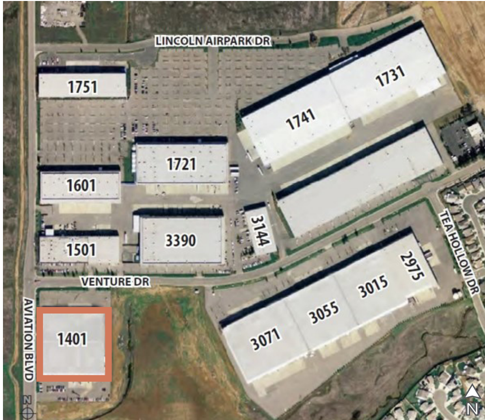
MAPS NOT TO SCALE