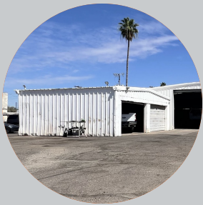
±832 SF Bonus Structure