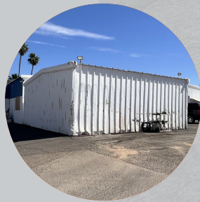
±546 SF Bonus Structure