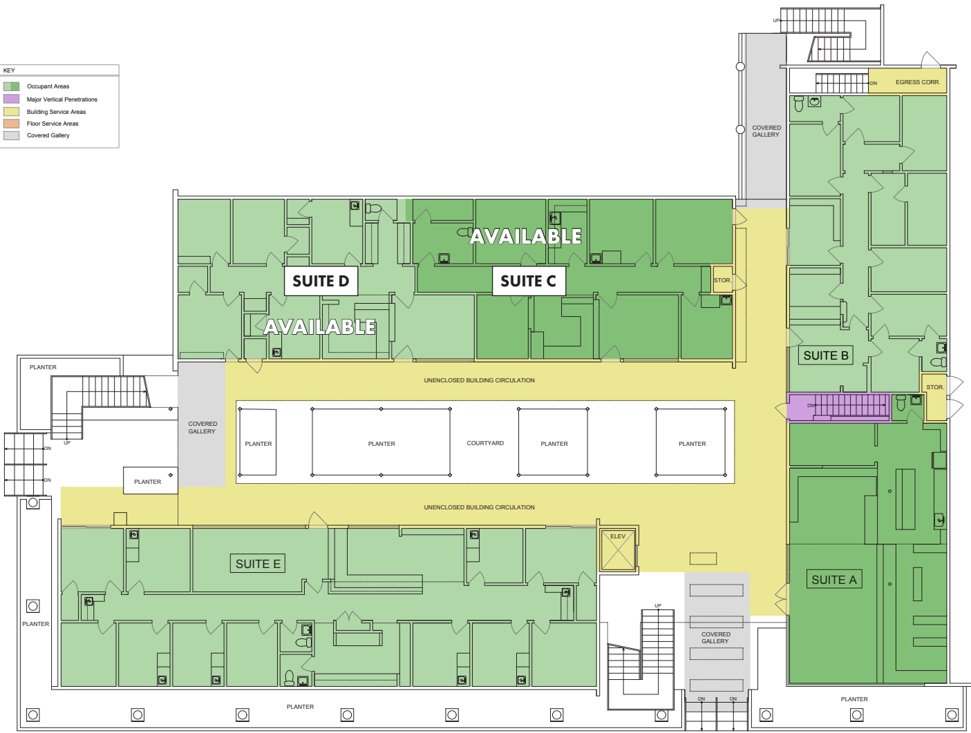
FIRST FLOOR SCALE: 1/4"=1'-0"