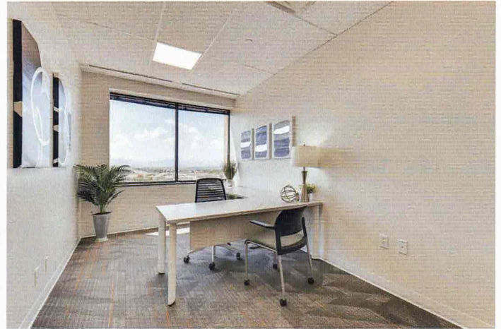
Representative Photo: Northglenn