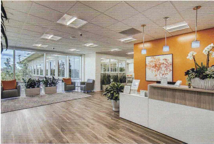
Representative Photo: Houston Energy Corridor