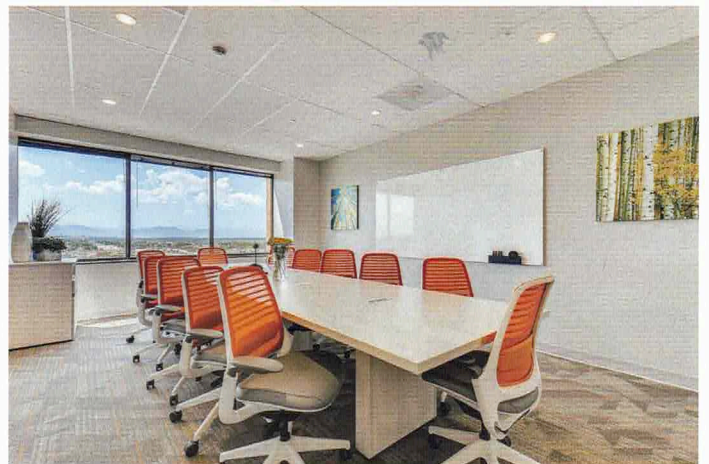
Representative Photo: Northglenn