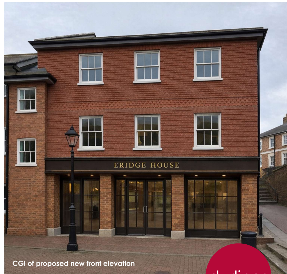
CGI of proposed new front elevation