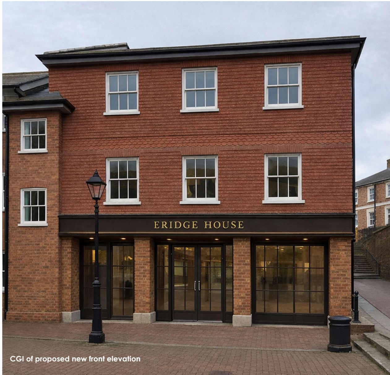
CGI of proposed new front elevation

Contact Rupert Farrant on 01892 552500 rupert@durlings.co.uk www.durlings.co.uk 22 Mount Ephriam Road, Tunbridge Wells, Kent, TN1 1ED