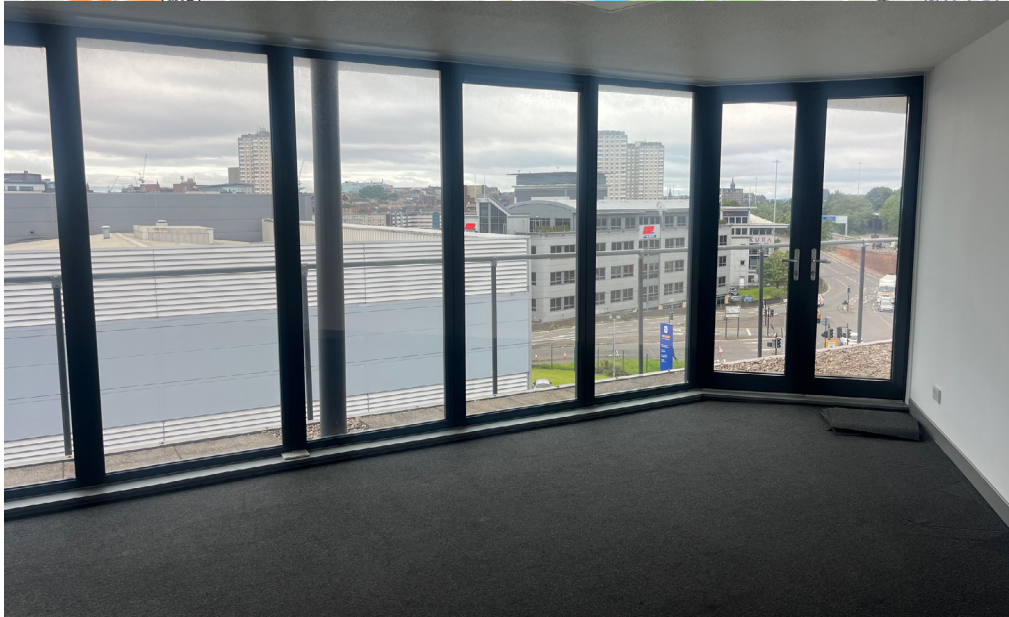
CHALLENGE HOUSE | 29 CANAL STREET | GLASGOW | G4 0AD