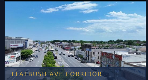
FLATBUSH AVE CORRIDOR