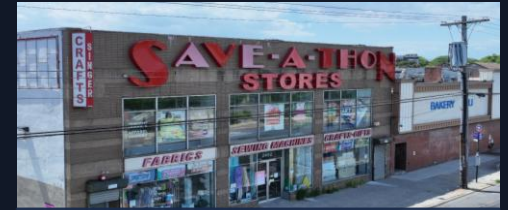
DRONE AERIAL VIEW