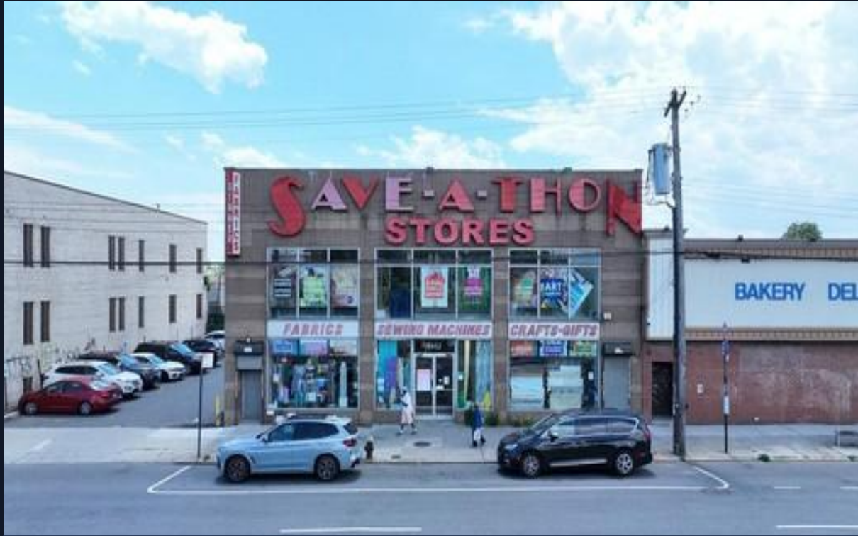
PROPERTY EXTERIOR · FLATBUSH AVENUE FRONTAGE