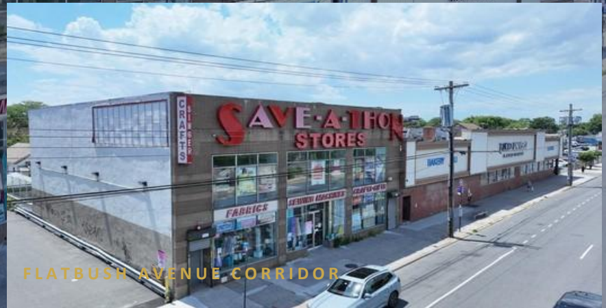
FLATBUSH AVENUE CORRIDOR