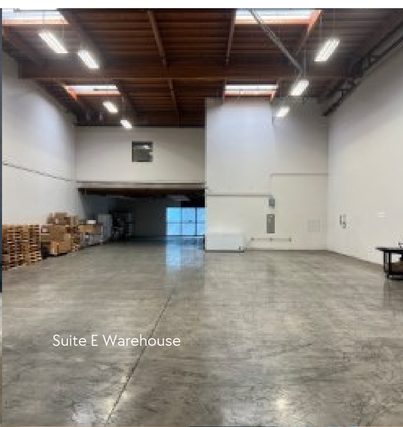
Suite E Warehouse