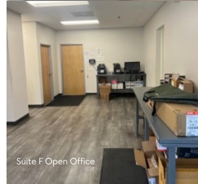
Suite F Open Office