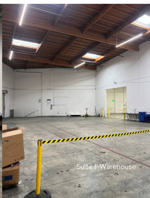
Suite F Warehouse