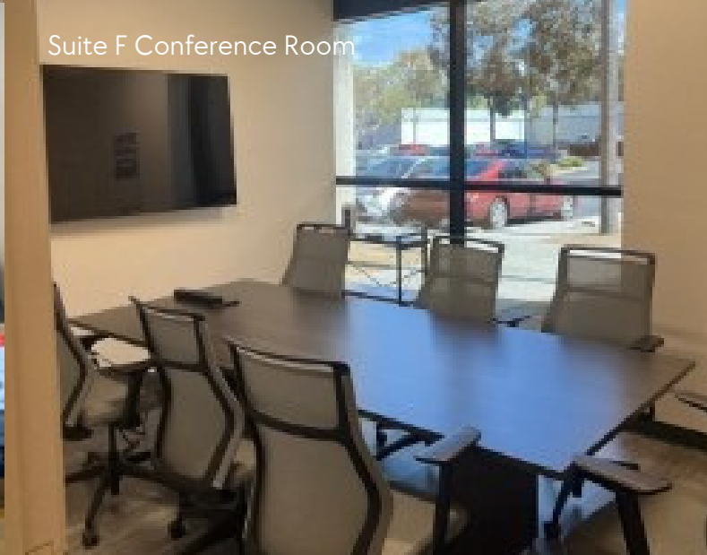
Suite F Conference Room