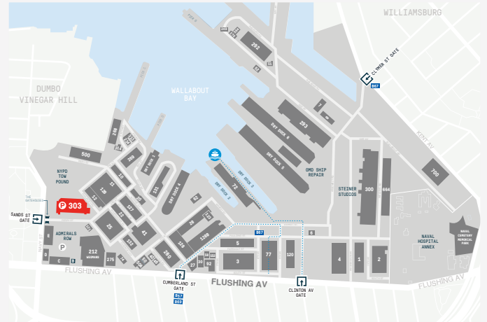
BLDG 303 LOCATION