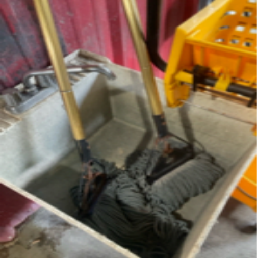
45. Physical Facilities Physical facilities installed, maintained, and clean Image.png