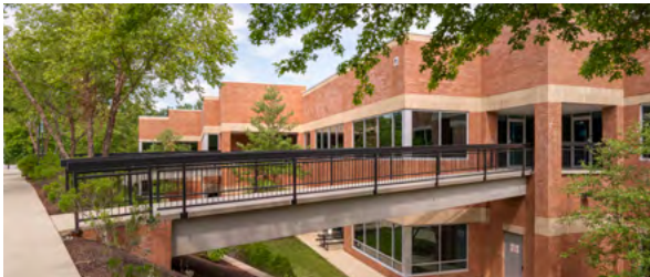
16900 Science Drive

Melford Town Center's two-story office buildings located along Science Drive offer an over-and-under style of architecture. This style provides direct street access from the second floor.