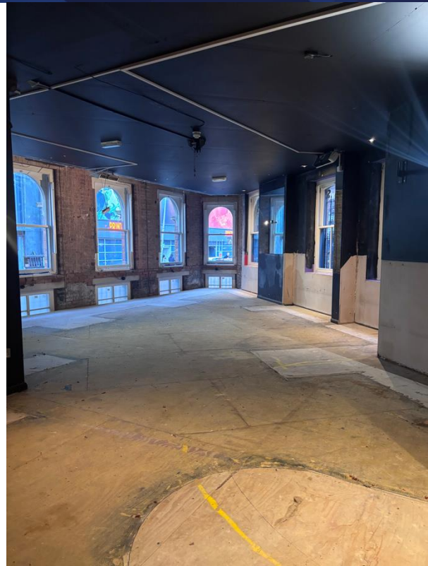
Upper ground floor