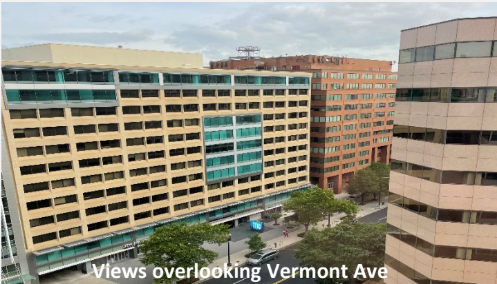
Views overlooking Vermont Ave