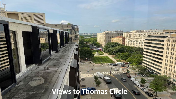
Views to Thomas Circle