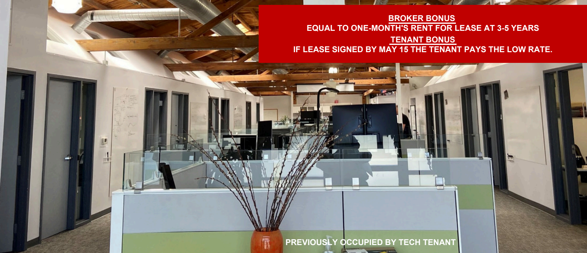
PREVIOUSLY OCCUPIED BY TECH TENANT

BROKER BONUS EQUAL TO ONE-MONTH'S RENT FOR LEASE AT 3-5 YEARS TENANT BONUS IF LEASE SIGNED BY MAY 15 THE TENANT PAYS THE LOW RATE.