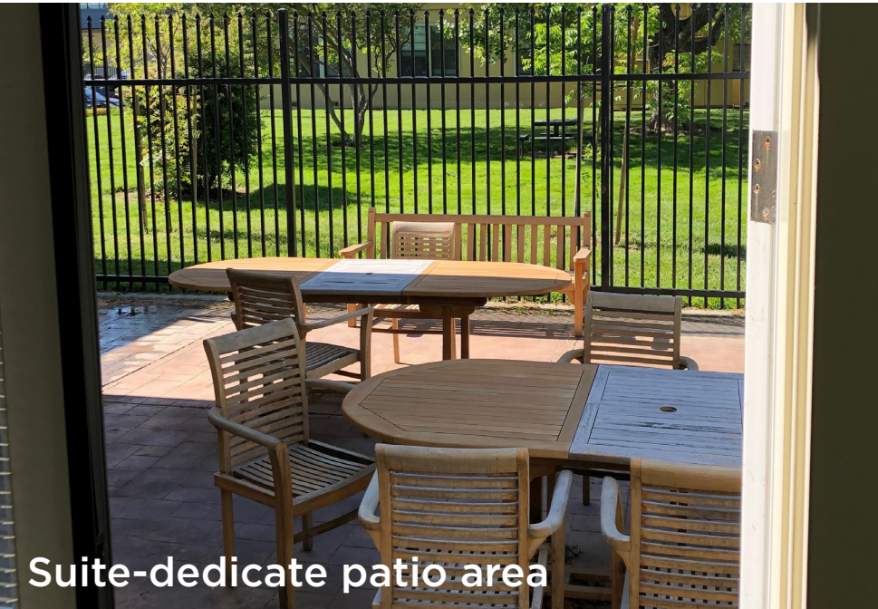
Suite-dedicate patio area