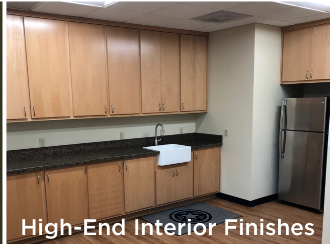
High-End Interior Finishes