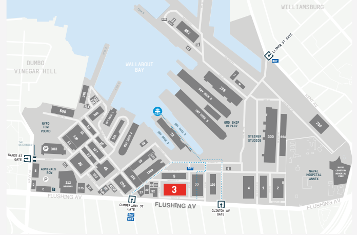
BLDG 3 LOCATION