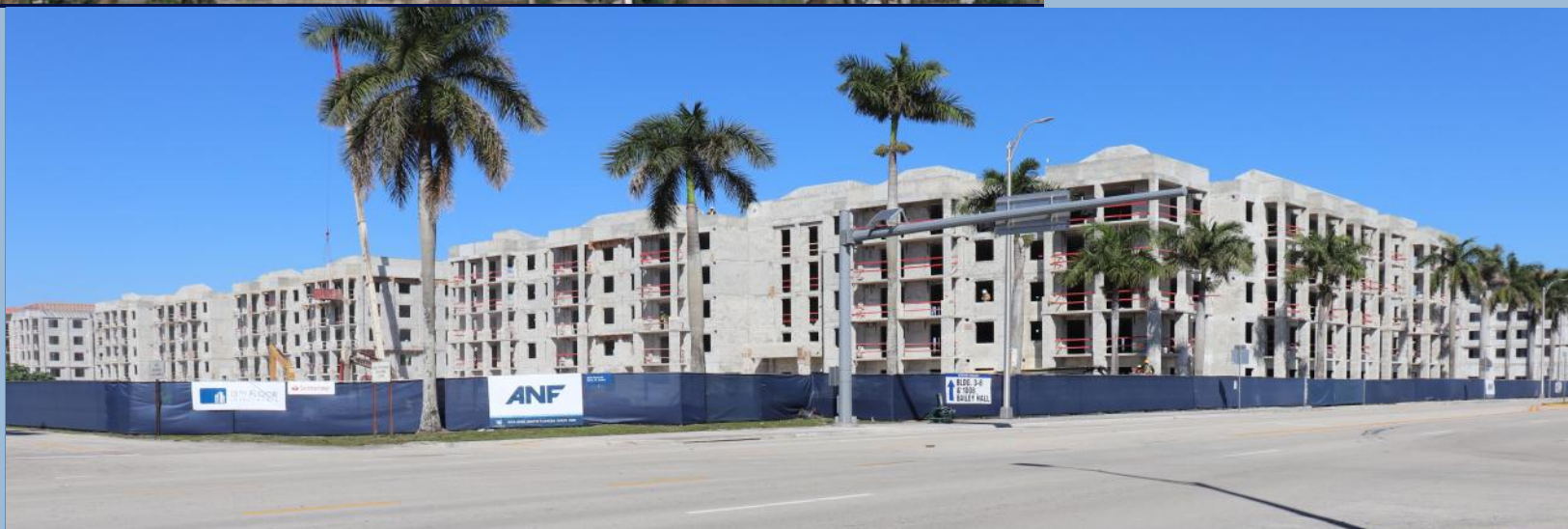
VIEW FROM VARSITY SQUARE LOOKING WEST