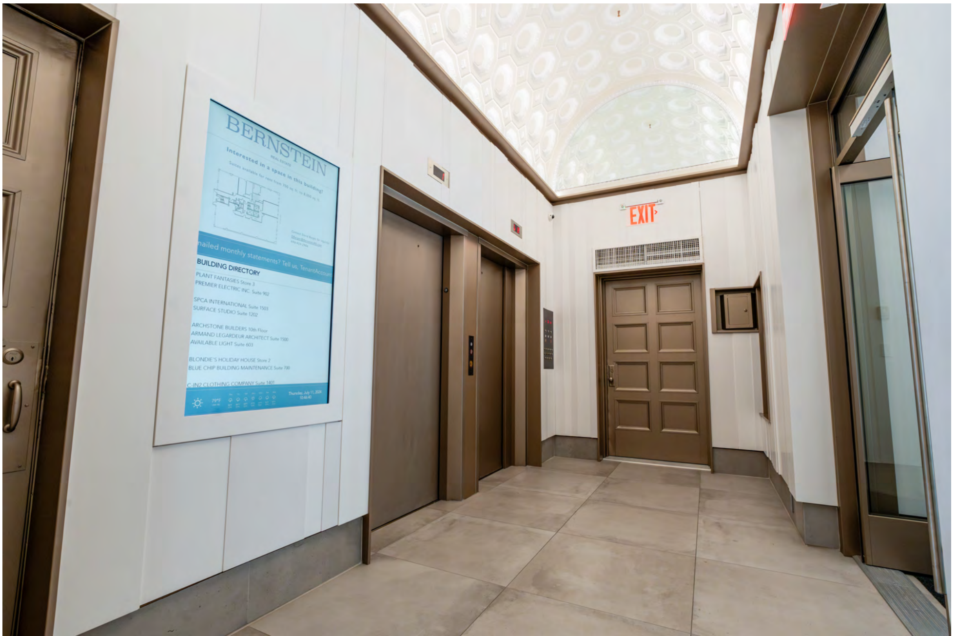
Brand new renovated lobby Upgraded elevators (2 passenger, 1 freight)