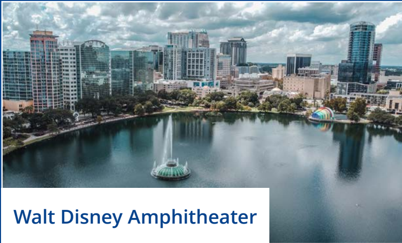
Walt Disney Amphitheater