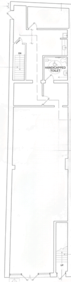
Ground Floor 2,416 RSF