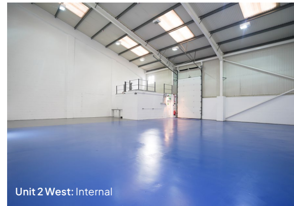
Unit 2 West: Internal