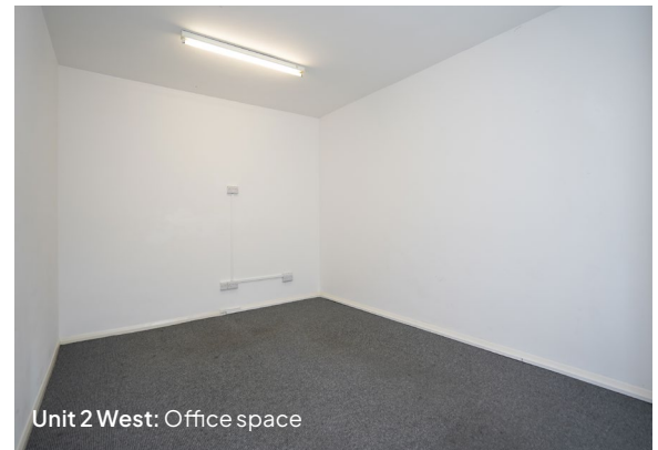
Unit 2 West: Office space