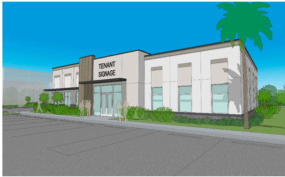
03 LOOKING SOUTHWEST