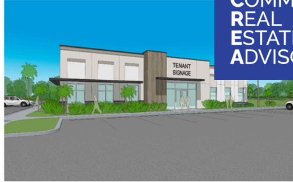
01 LOOKING WEST