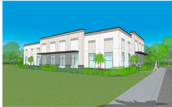
02 LOOKING NORTHEAST