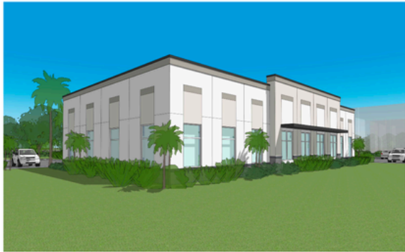
04 LOOKING SOUTHEAST