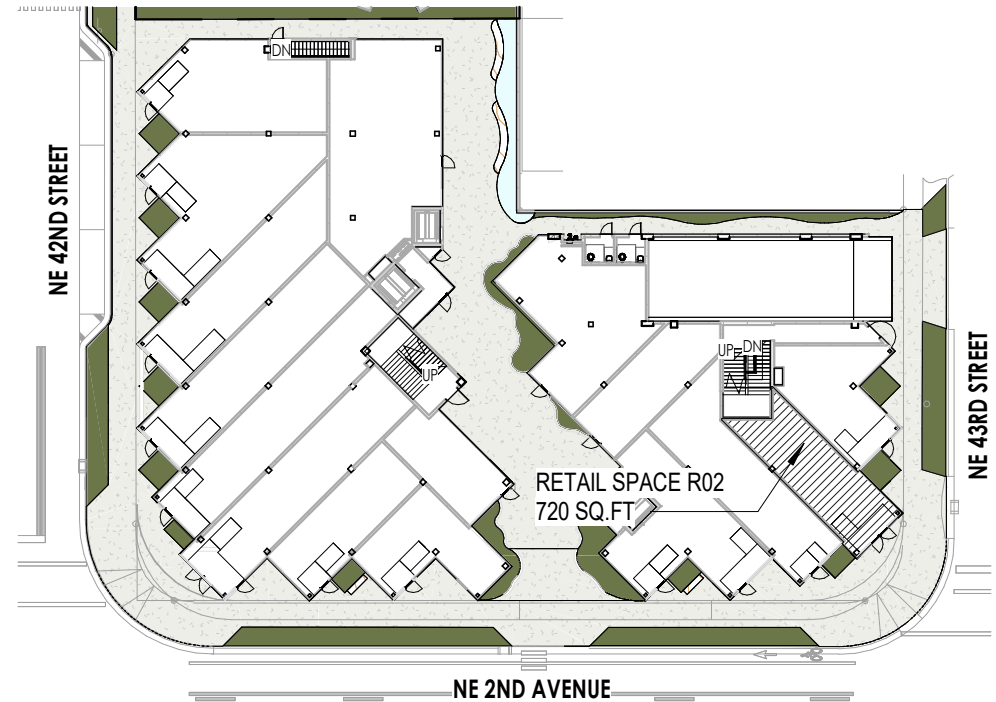
1 KEY PLAN SCALE: 1" = 50'-0"

Copyright Statement: All drawings and written material appearing herein are the original and unpublished work of TAG Architecture LLC, and may not be duplicated, used, or disclosed without the express written consent of TAG Architecture LLC. © 2023