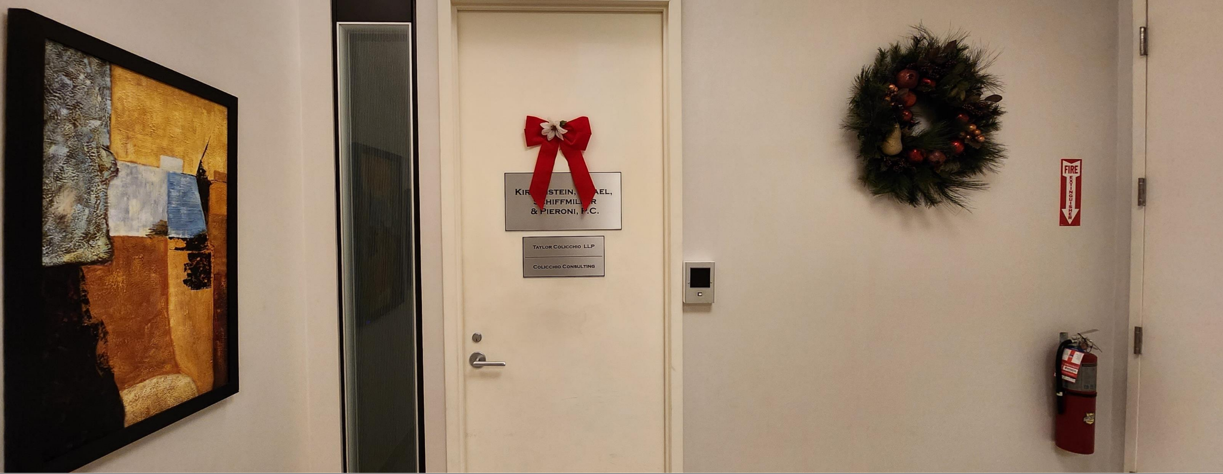
5 th floor entrance