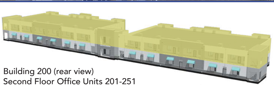
Building 200 (rear view) Second Floor Office Units 201-251