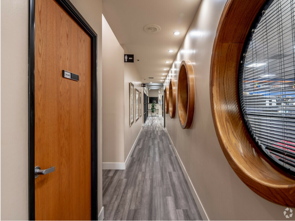
1985 S. Santa Cruz St. = Hallway to Offices and Restrooms - Now Available