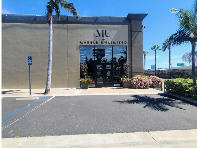
Marble Unlimited Main Entrance - Currently Leased

1985-1985 S Santa Cruz St, Anaheim, CA 92805