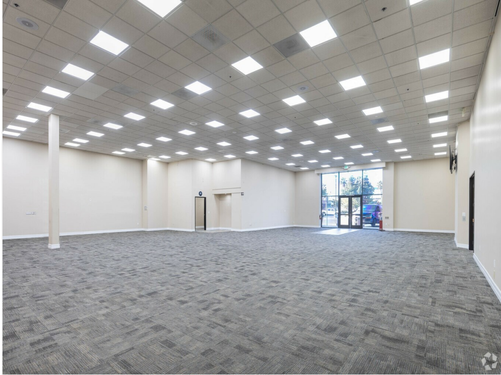
CrossFit Anaheim - Occupied