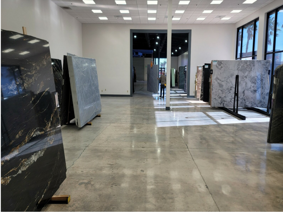
Marble Unlimited Showroom - Currently Leased