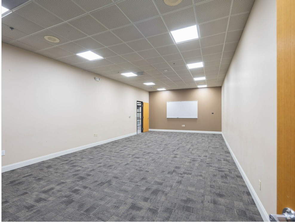
1985 S. Santa Cruz St. - Open Area - Now Available