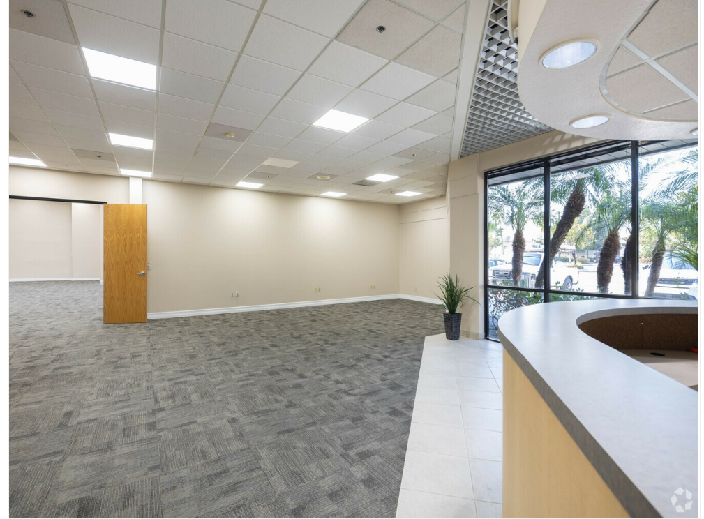
1985 S. Santa Cruz St. - Now Available