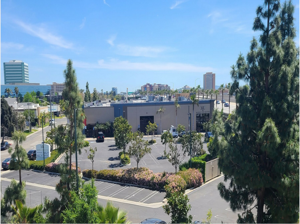
Onsite Free Parking