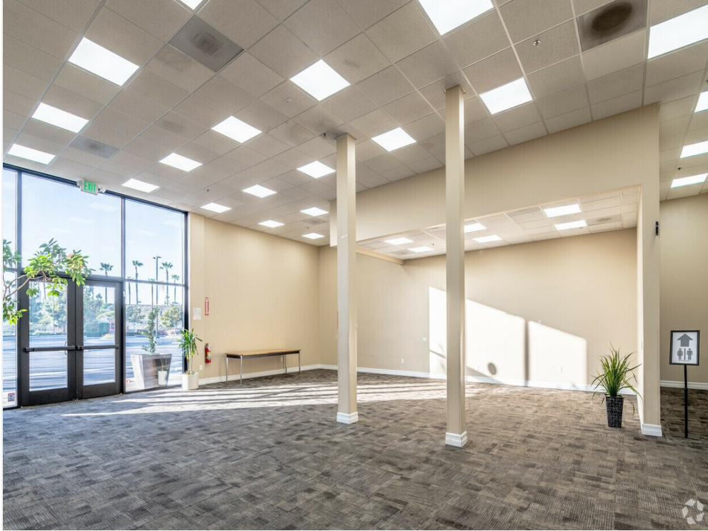
Marble Unlimited - Occupied