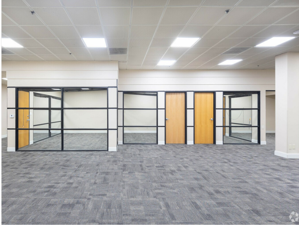
Crossfit Anaheim - Occupied