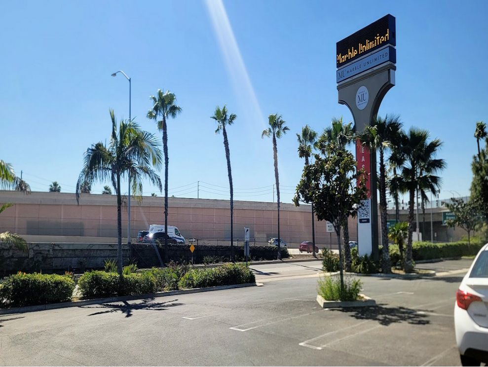
Freeway Sign / Anaheim Way Entrance