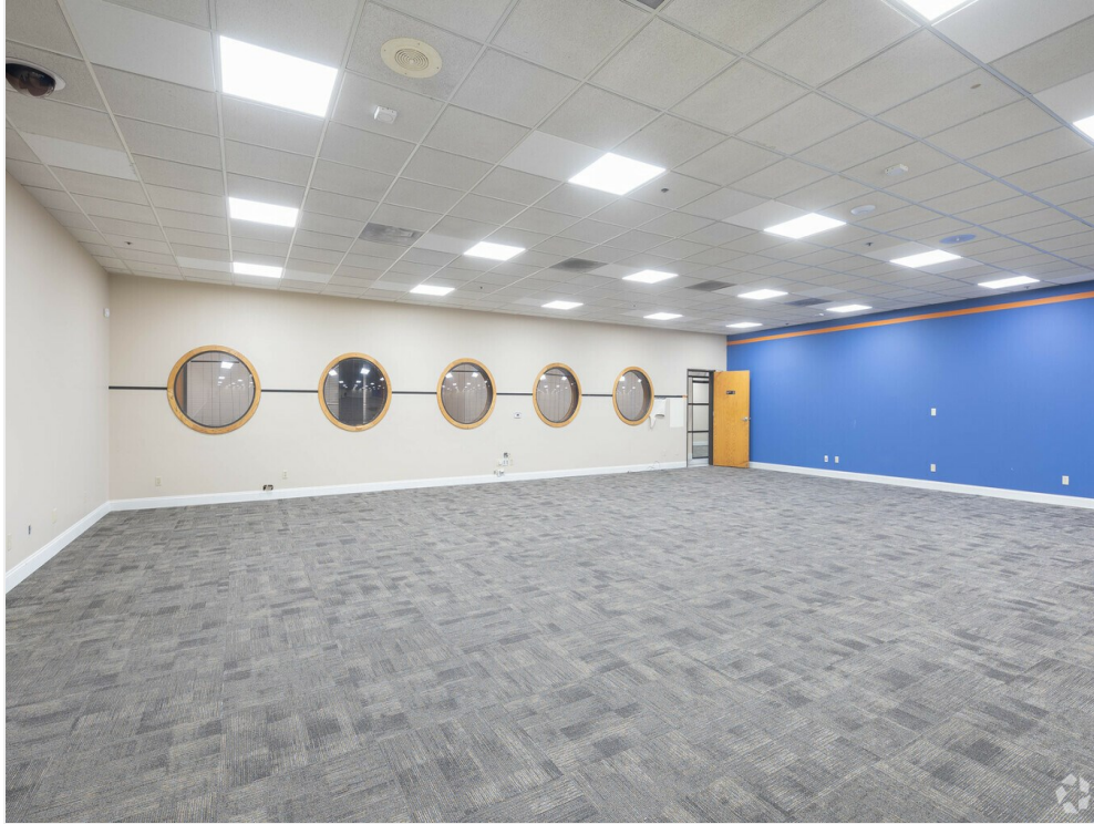
1985 S. Santa Cruz St. - Now Available