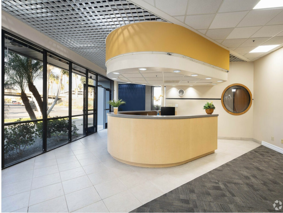
1985 S. Santa Cruz St. - Front Lobby - Now Available