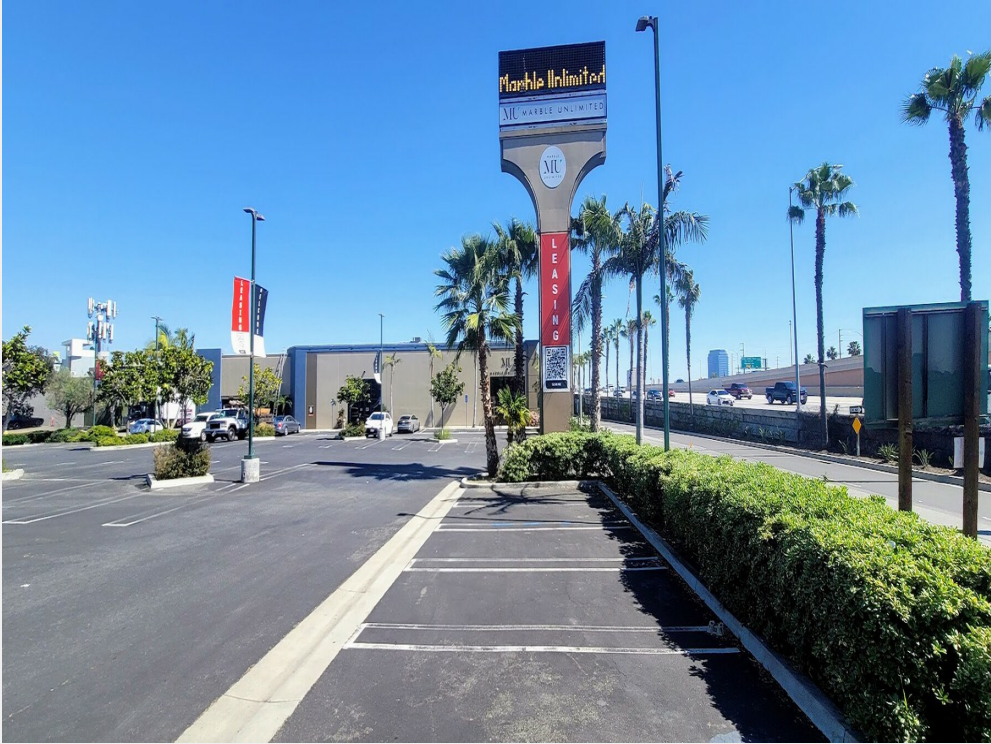
Freeway visible Board