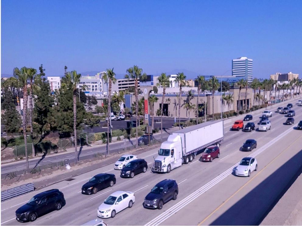
View From 5 Freeway