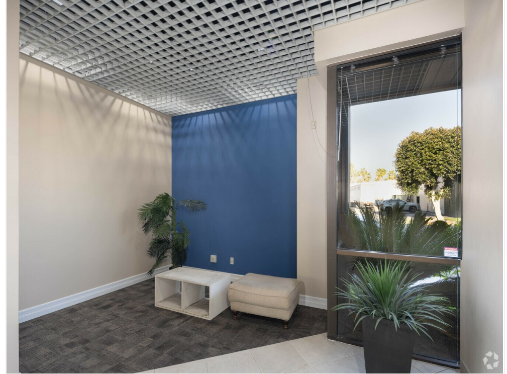
1985 S. Santa Cruz St. - Waiting Area - Now Available