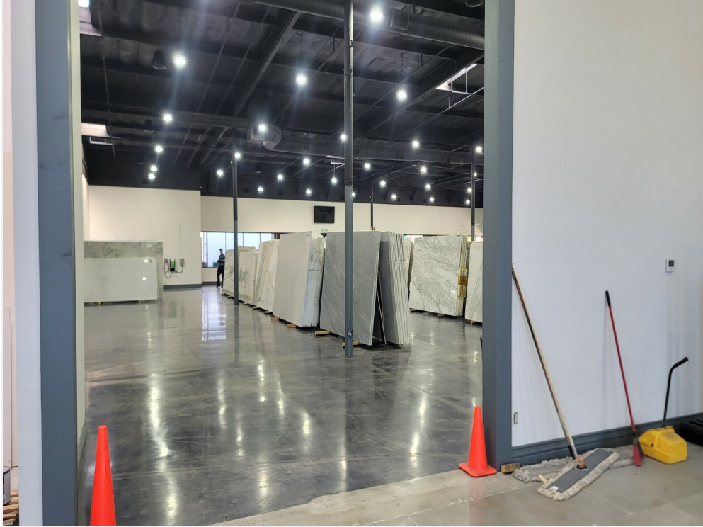
Marble Unlimited Showroom - Currently Leased