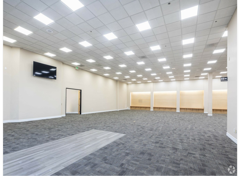
CrossFit Anaheim - Occupied