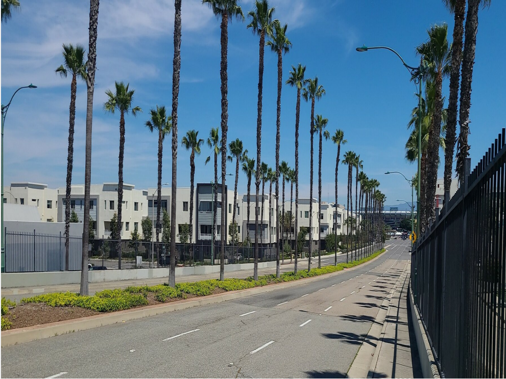
Platinum Triangle Nearby Housing