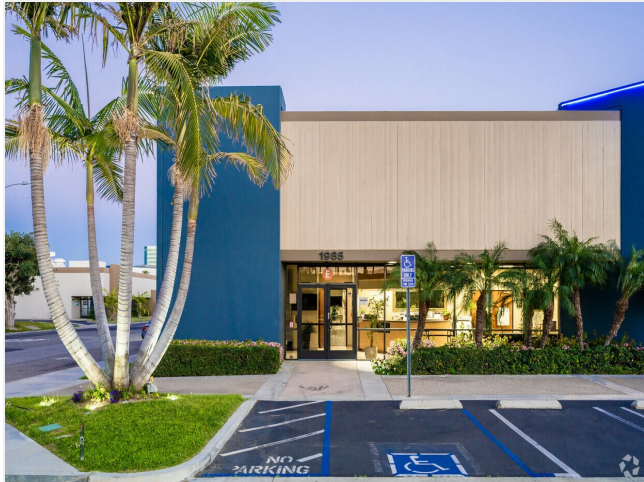
1985 S. Santa Cruz St. - Main Entrance to Offices/Showroom - Now Available

1985-1985 S Santa Cruz St, Anaheim, CA 92805