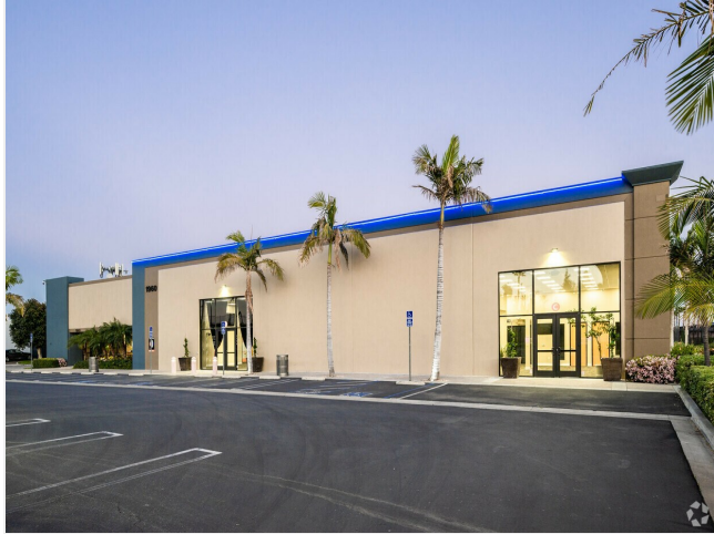
North Side View From Main Parking Area