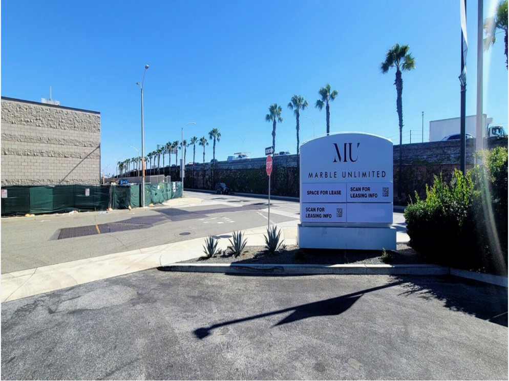
Monument Sign South side of the building view 2