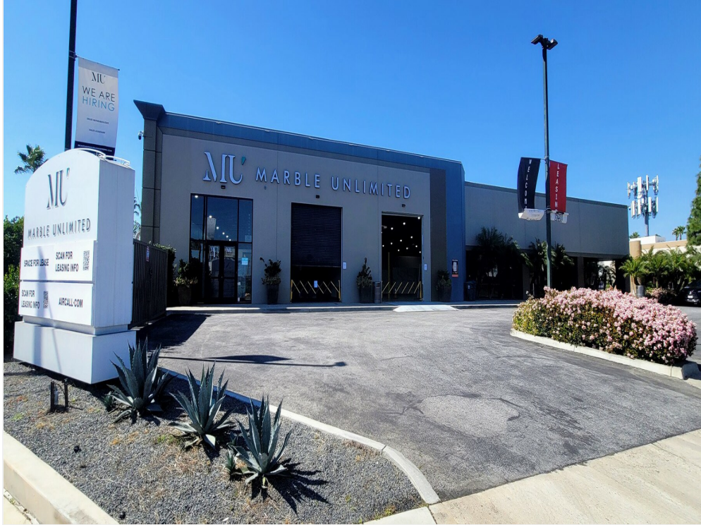
Marble Unlimited Back Entrance - Currently Leased