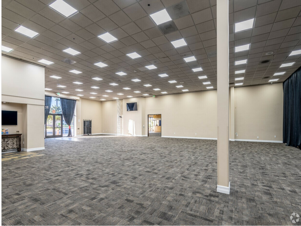
Crossfit Anaheim - Occupied