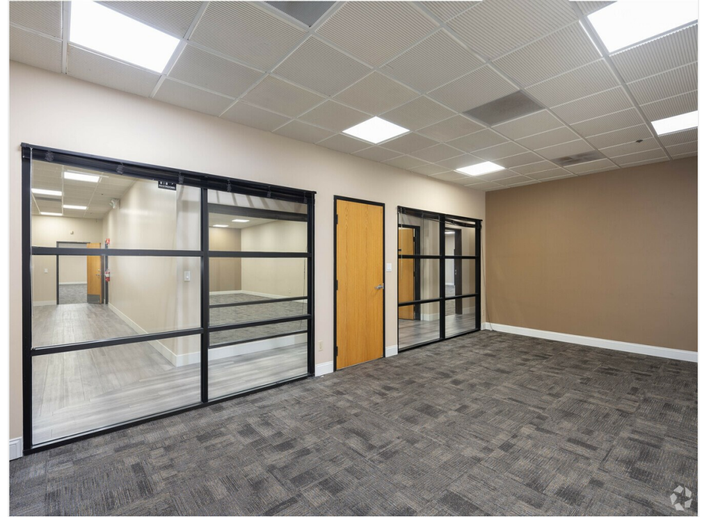
1985 S. Santa Cruz Street - Office Space - Now Available