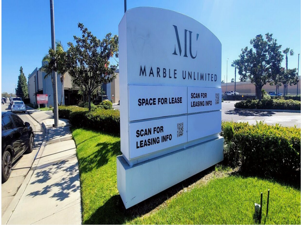
Monument Signs - Business Name Onon both sides of the building - Available For Tenants Business Name