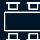
Shared conference rooms