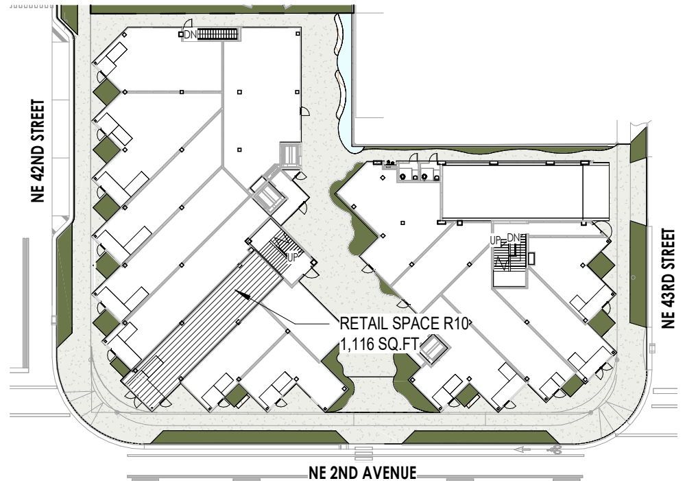
1 KEY PLAN SCALE: 1" = 50'-0"