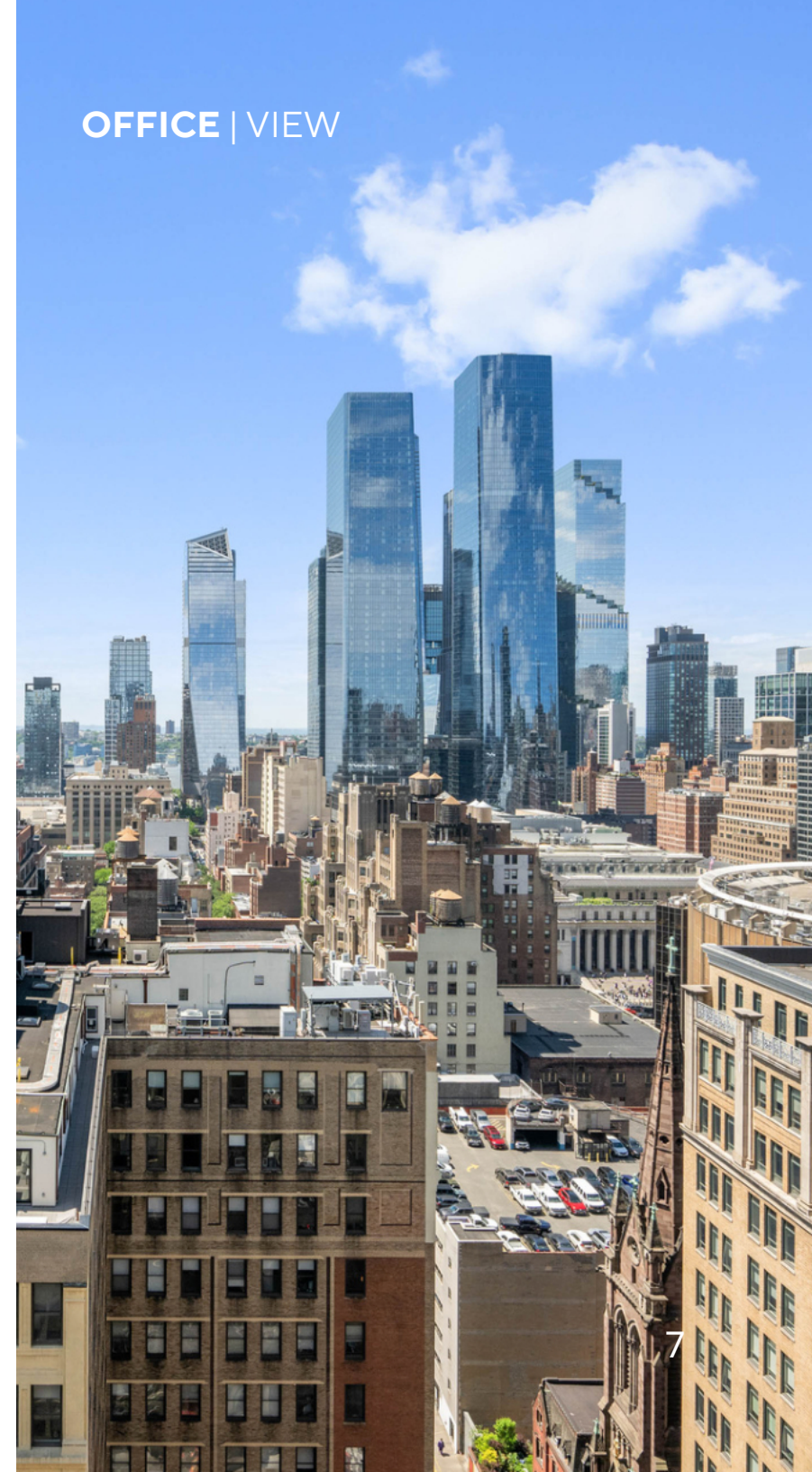
OFFICE | VIEW