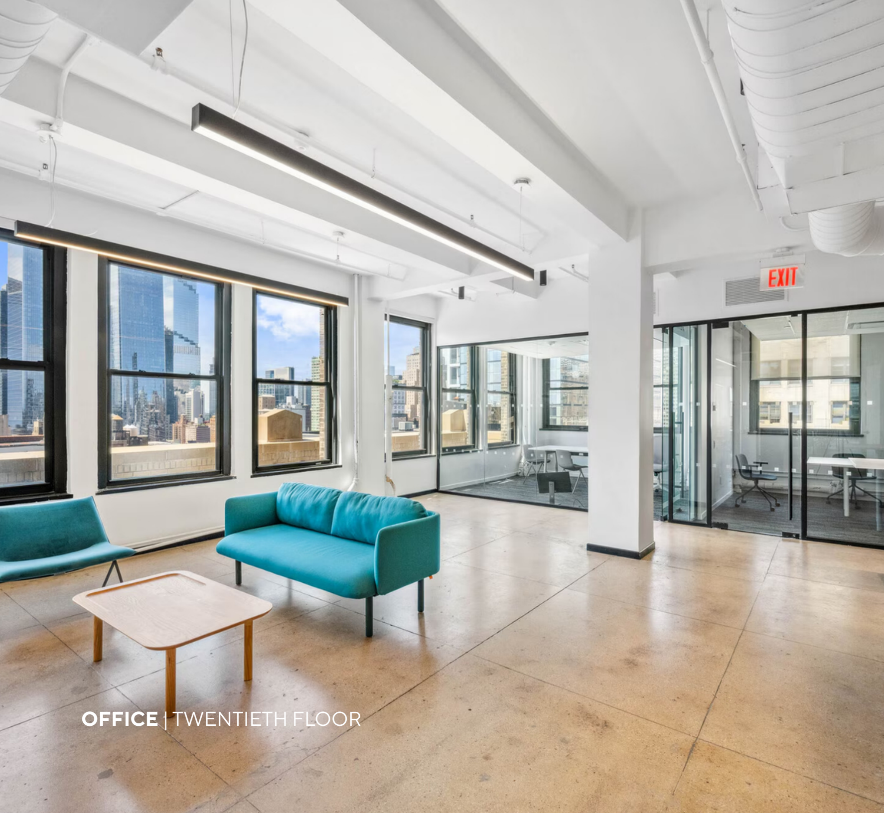
OFFICE | TWENTIETH FLOOR