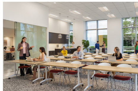
Venue Meetings & Events