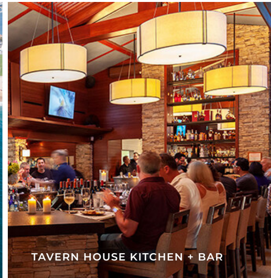
TAVERN HOUSE KITCHEN + BAR