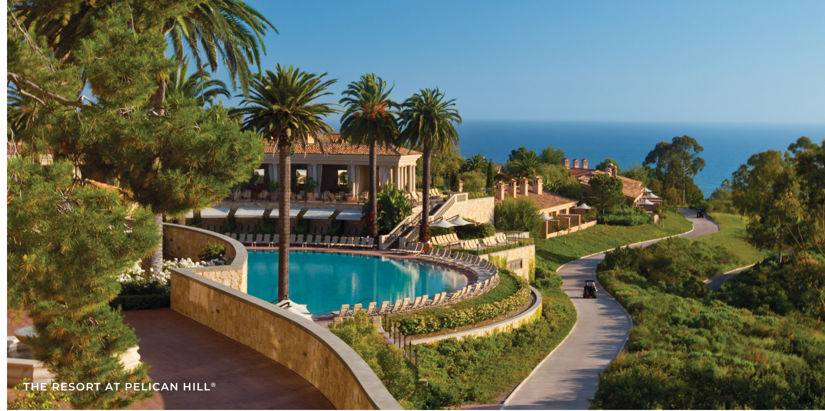
THE RESORT AT PELICAN HILL®