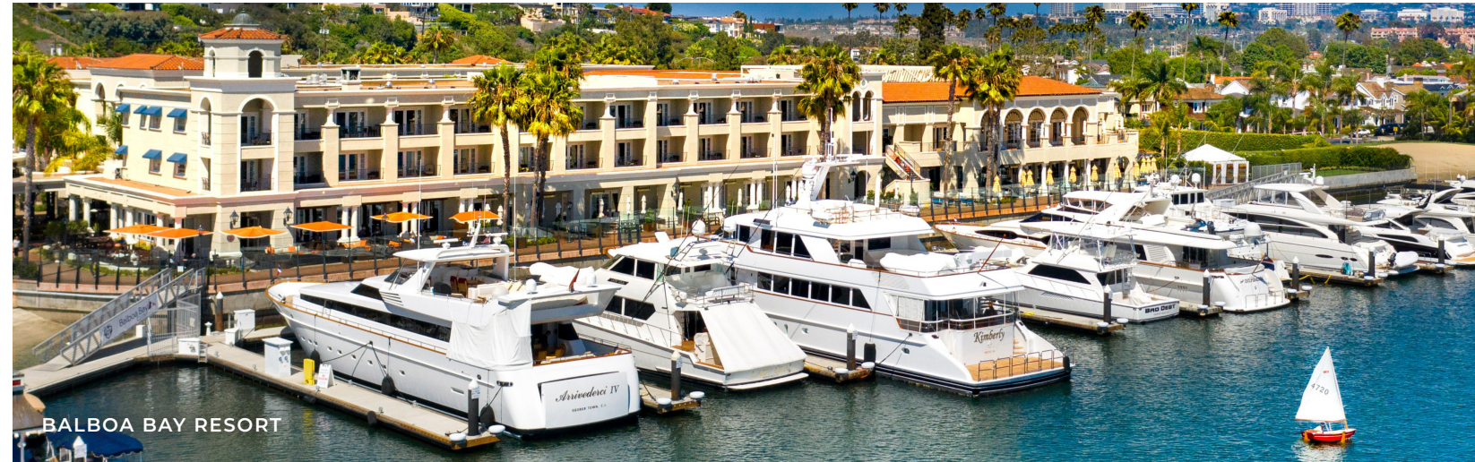
BALBOA BAY RESORT