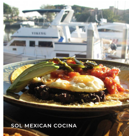
SOL MEXICAN COCINA