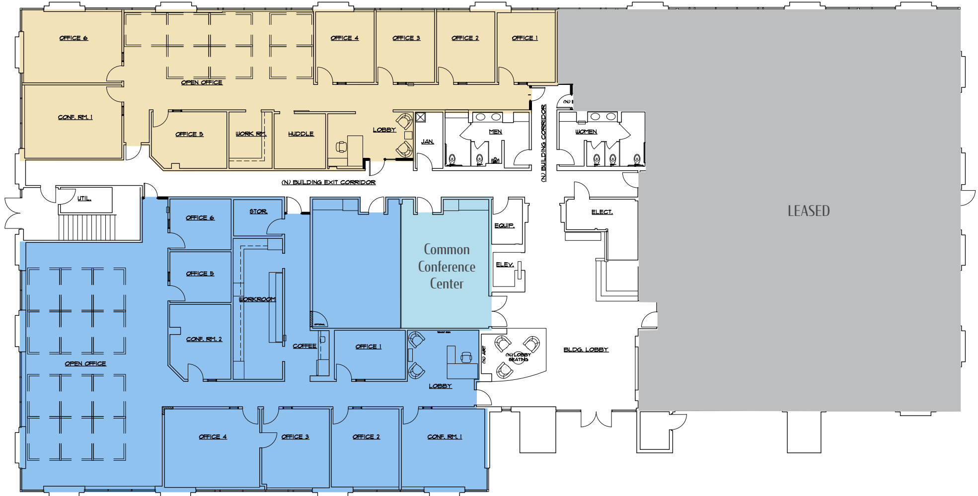
SUITE 180 - ±4,798 SF