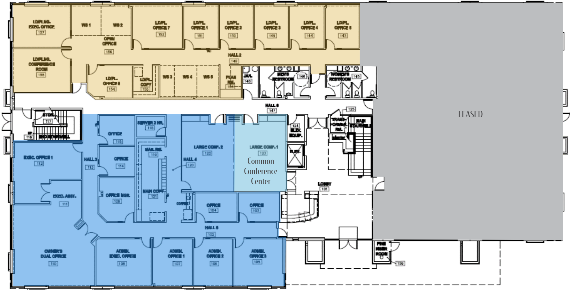
SUITE 180 - ±4,798 SF