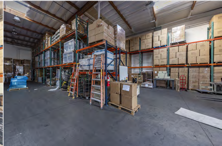
±20,111 SF TWO-STORY INDUSTRIAL / FLEX SUITE