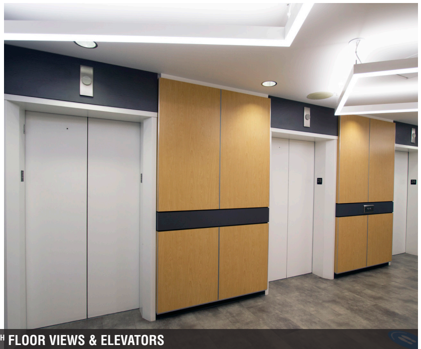
27 TH / 28 TH FLOOR VIEWS & ELEVATORS