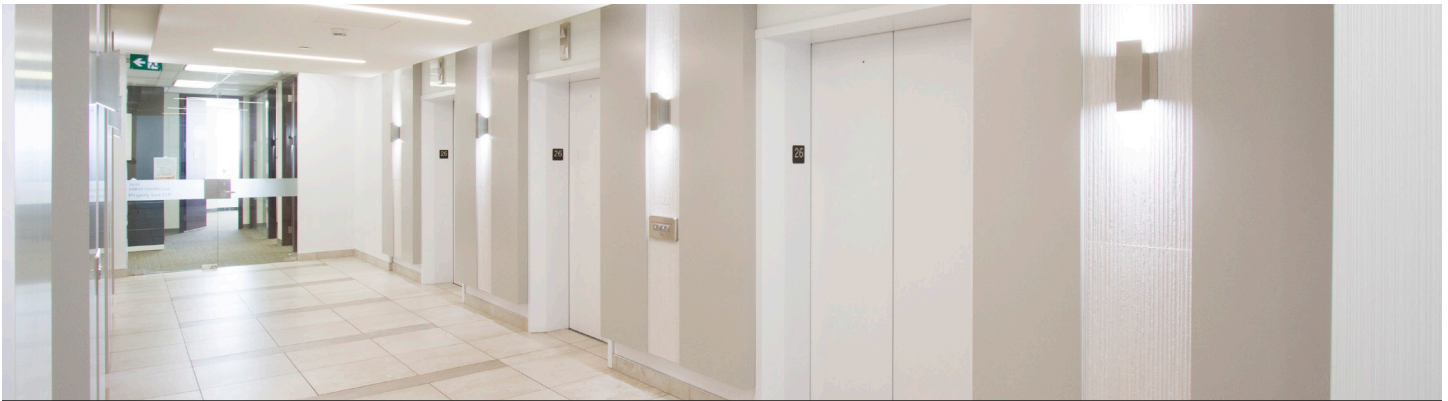
BUILDING STANDARD ELEVATOR LOBBY