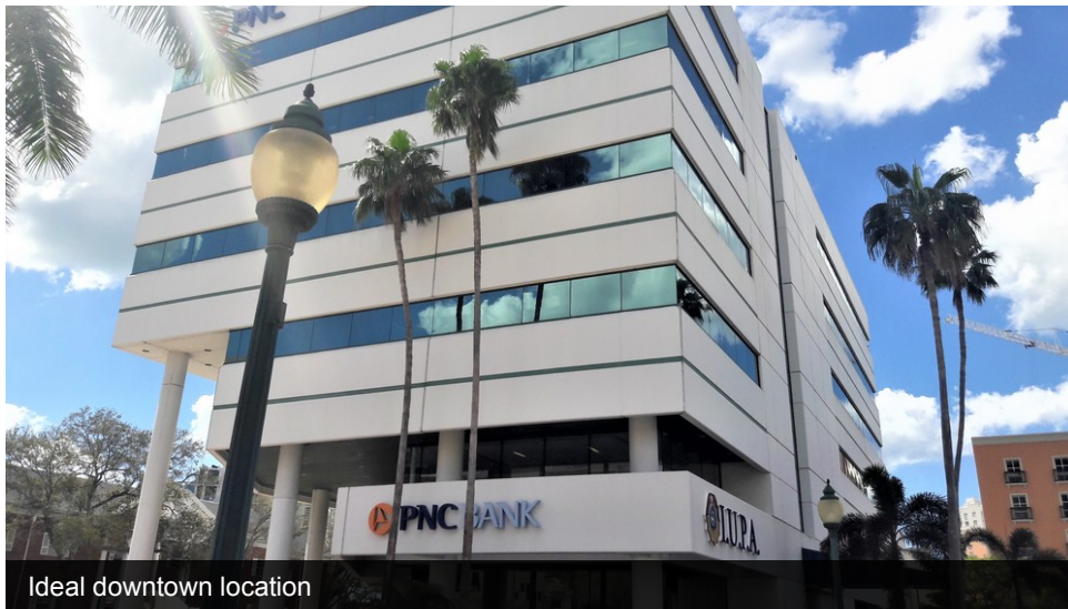
Ideal downtown location