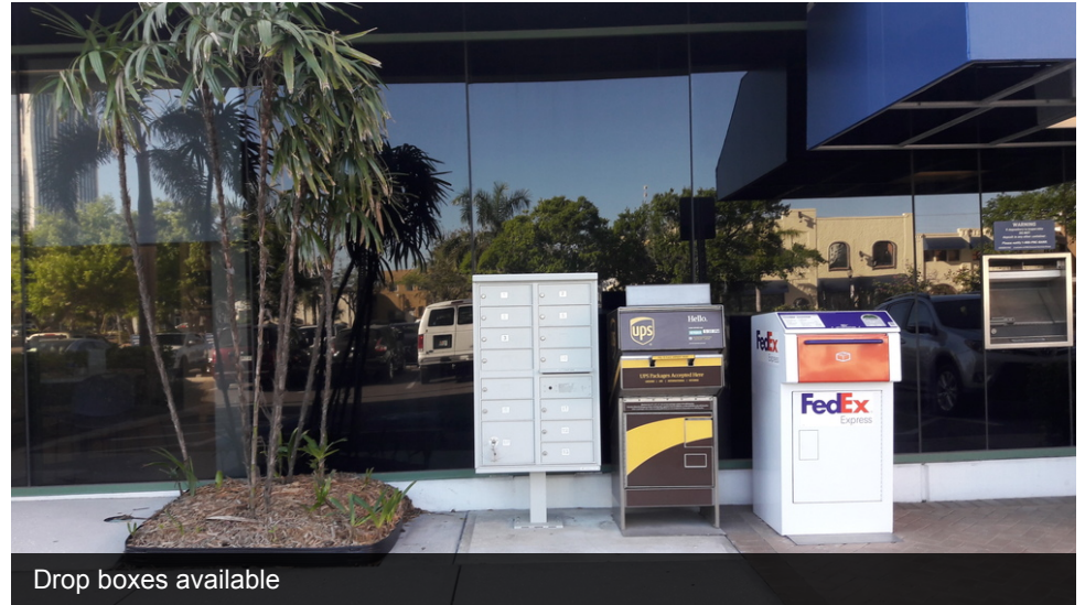
Drop boxes available