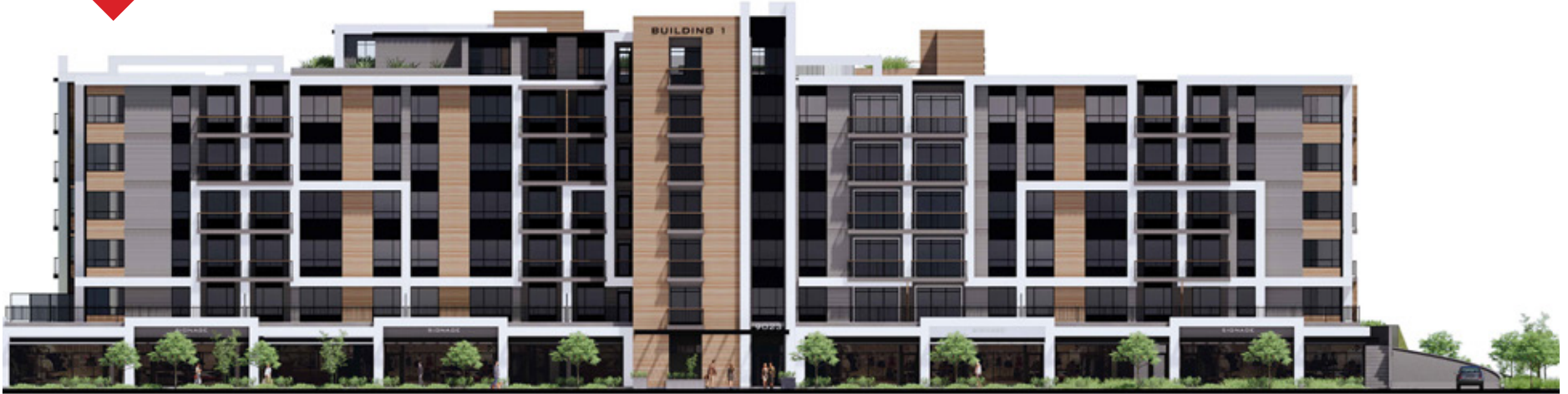
Visual renderings only*