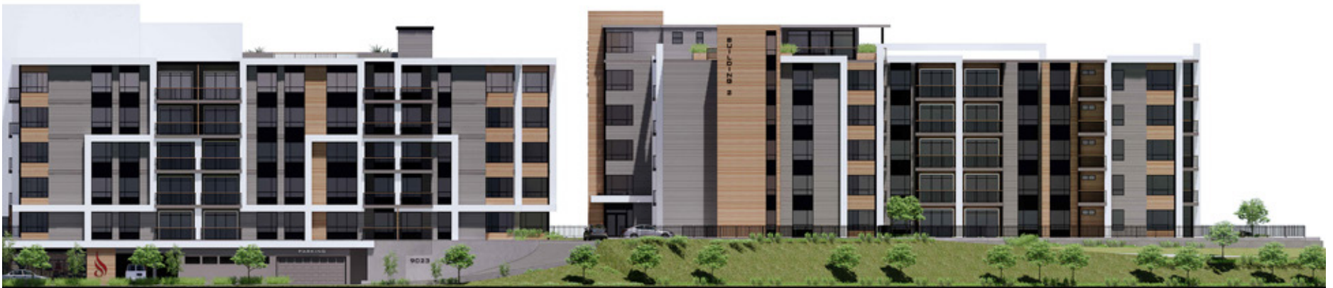
Visual renderings only*