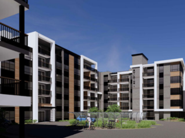
Visual renderings only*