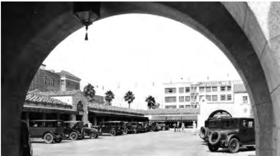
Chapman Market's Inner Courtyard

In modern times, the market is becoming more unique than ever. It continues to attract a wide mix of LA citizens looking to shop, dine and enjoy nightlife in this thriving corner of Koreatown.