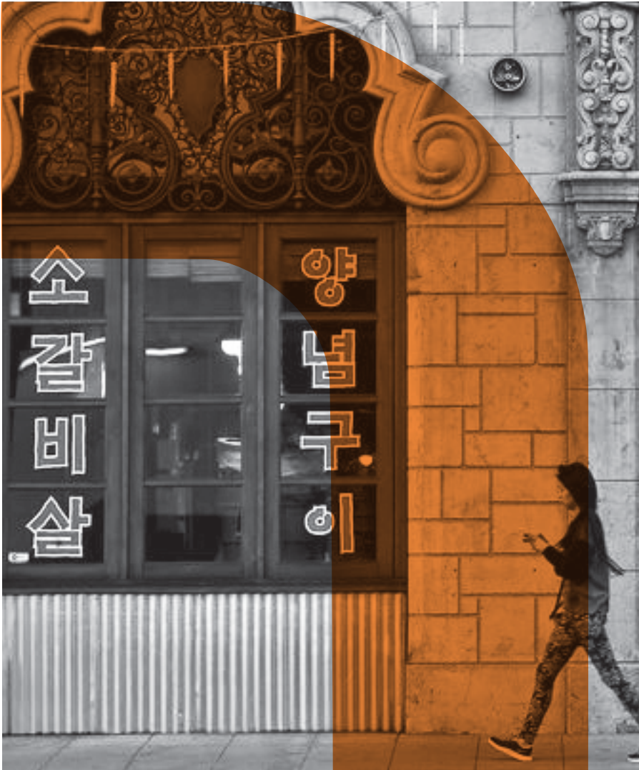
Chapman Market along Sixth Street