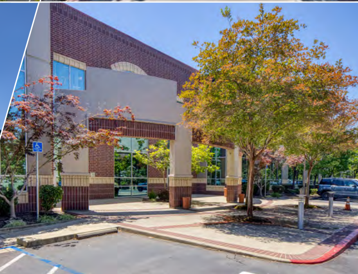
950 IRON POINT CIRCLE, FOLSOM | OFFICE FOR LEASE