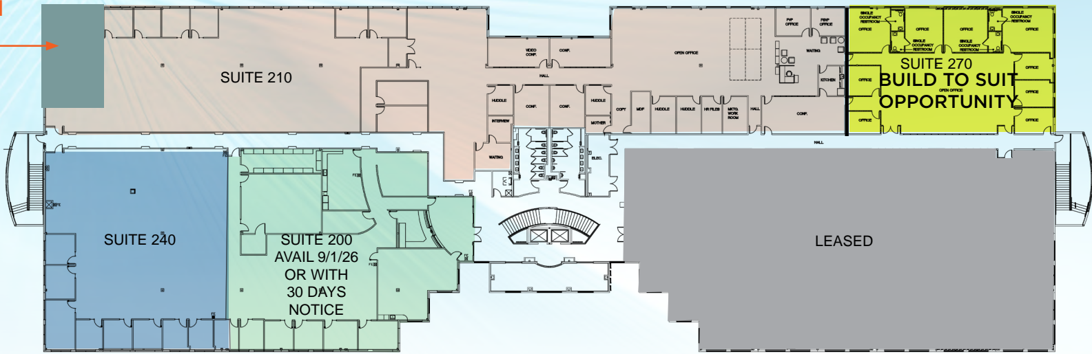
Suites 200, 210 240 & 270 are contiguous up to ±36,799 RSF