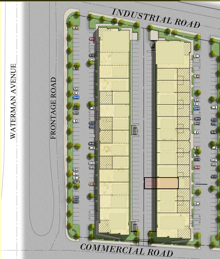
Exclusive Use Area

Gated Warehouse plus Exclusive Use Area 1,405 Square Feet B104 Warehouse