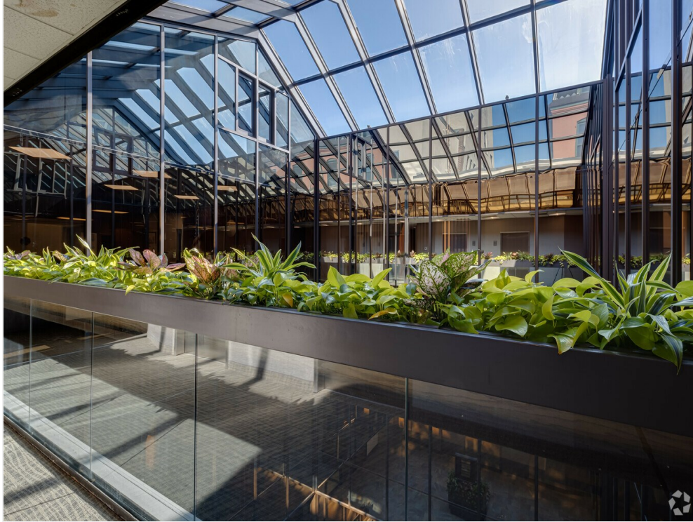
Energizing Work Environment