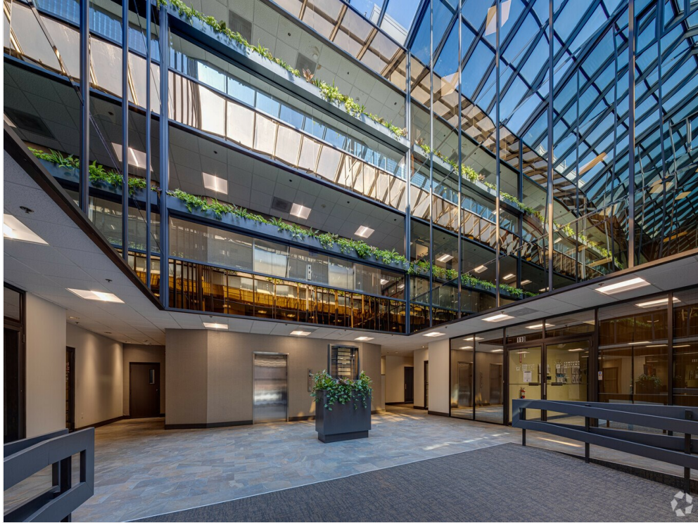
Natural Light Flooded