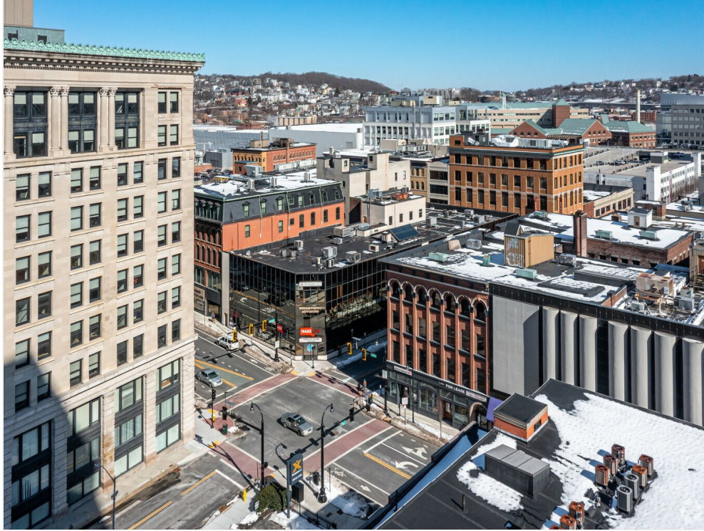
Downtown Worcester Location