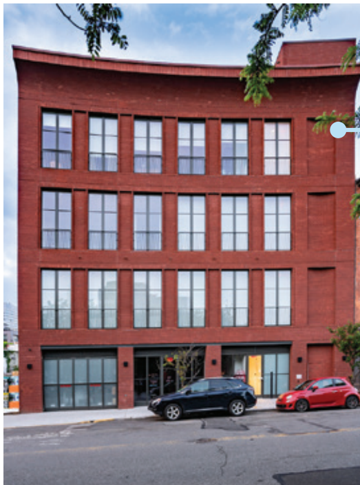
89 GRAND STREET