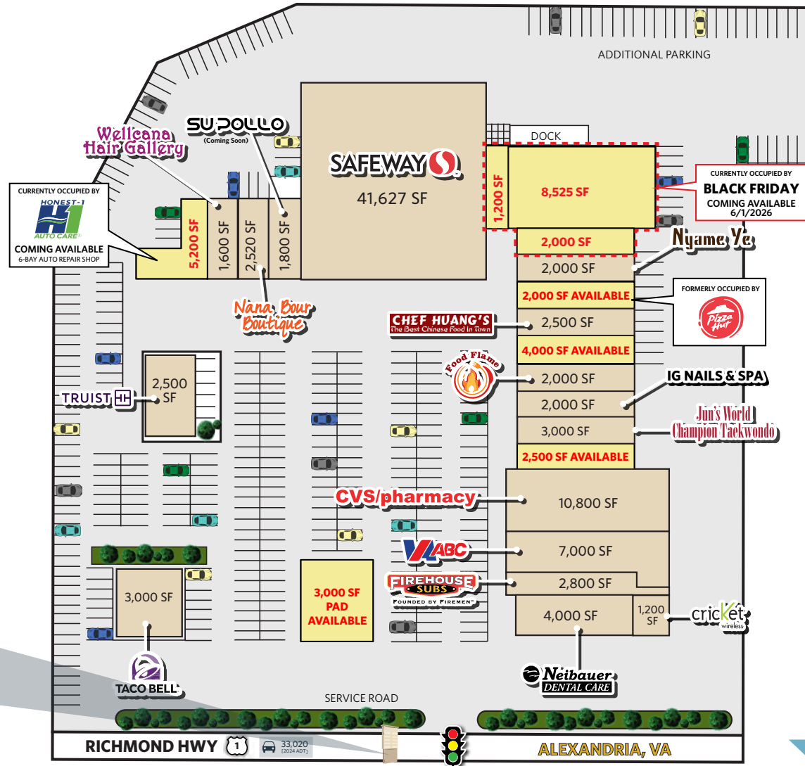
NEW PYLON SIGN

8626 Richmond Highway, Alexandria, VA 22309 Fairfax County