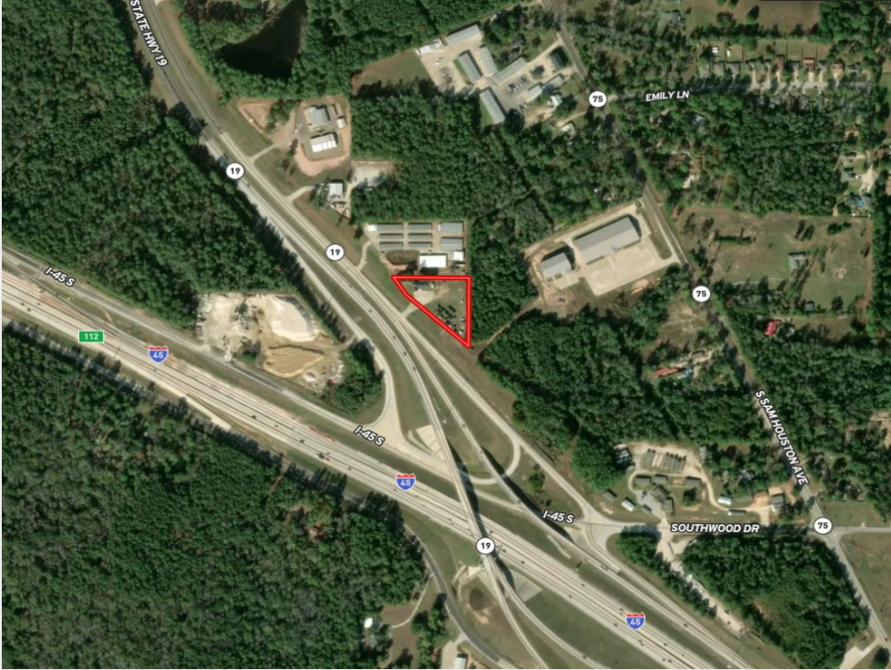
Aerial with I45