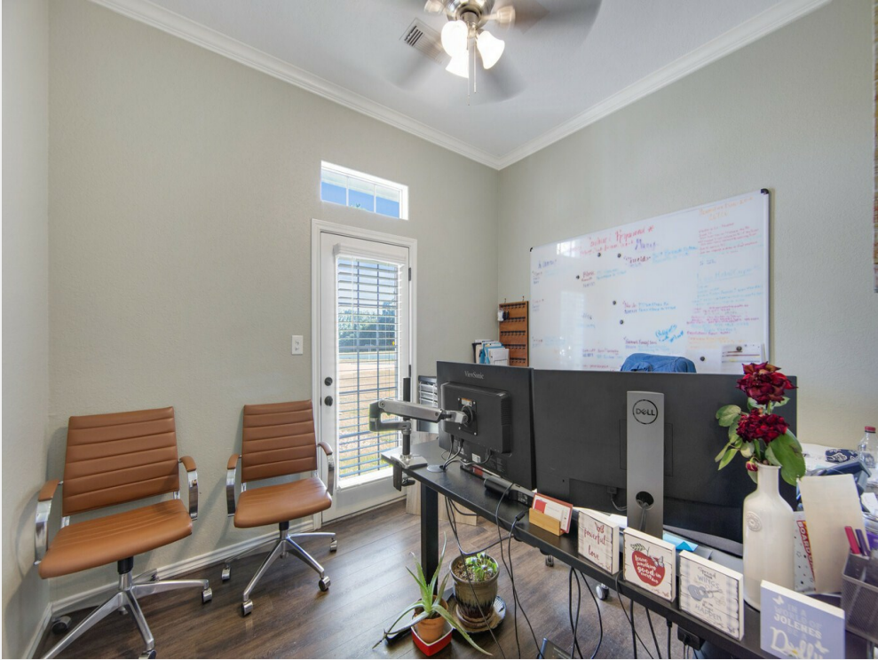
140 SH-19 N-25