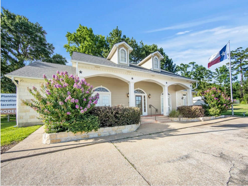
Office building 2