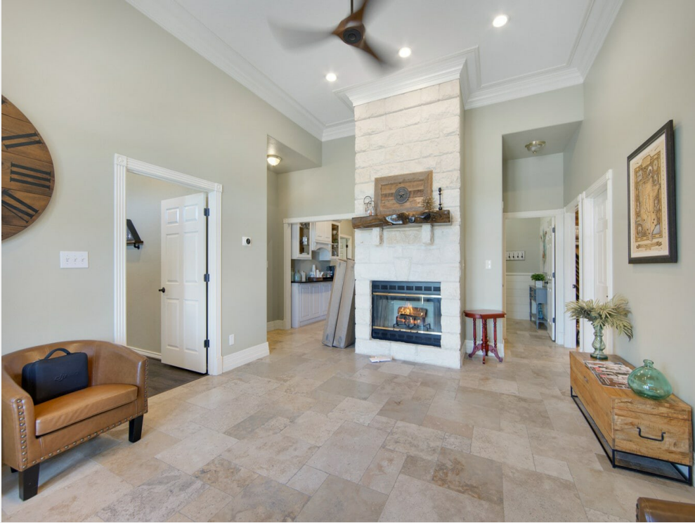
140 SH-19 N-18