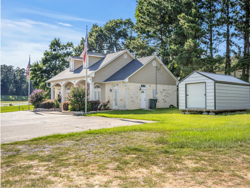
140 SH-19 N-12