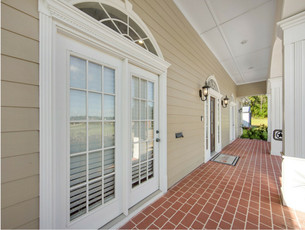
140 SH-19 N-31