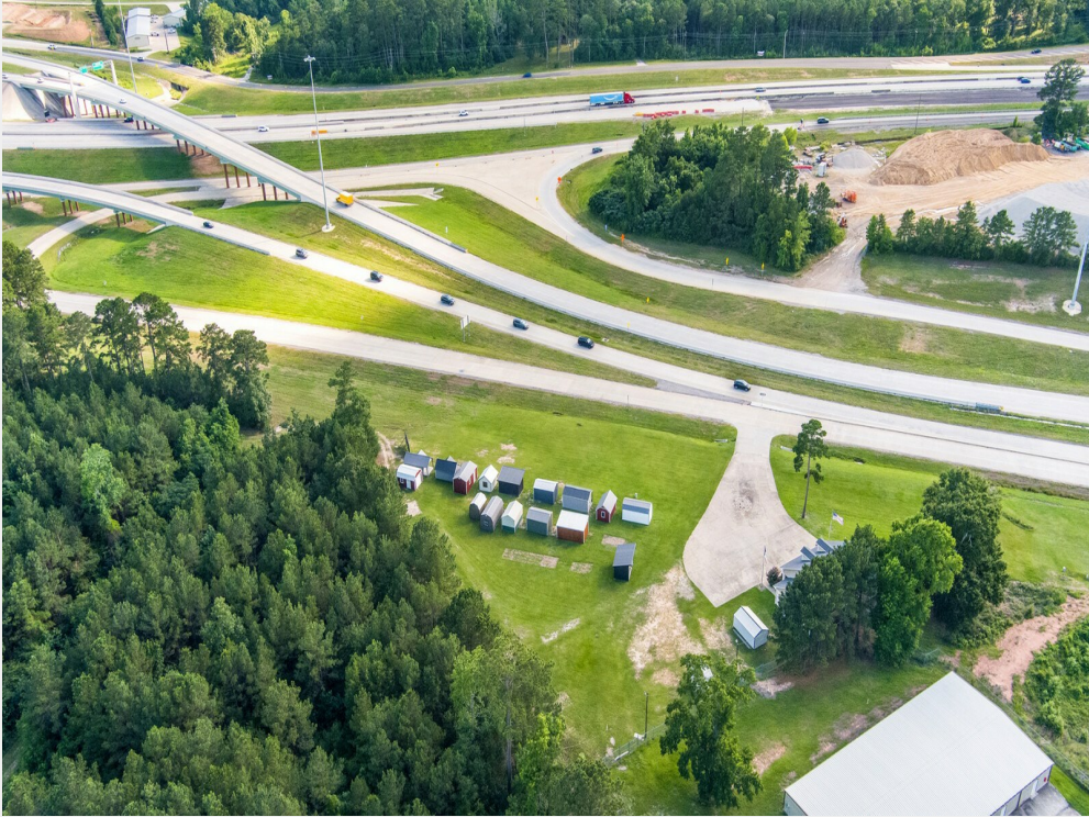
140 SH-19 N-8