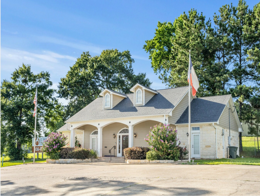
140 SH-19 N-14