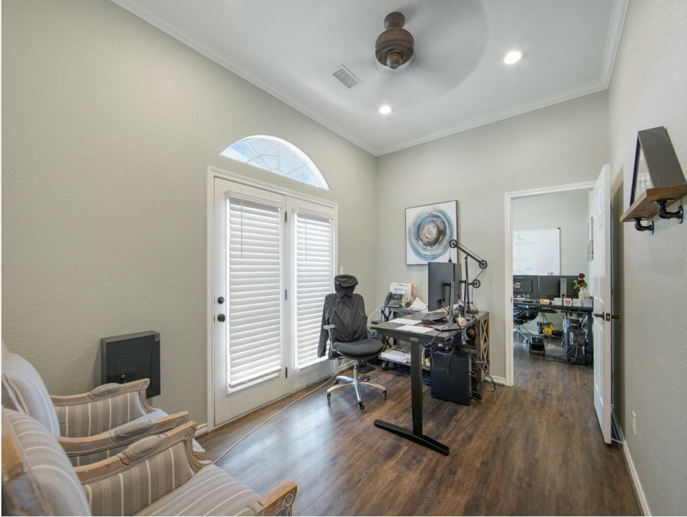
140 SH-19 N-24