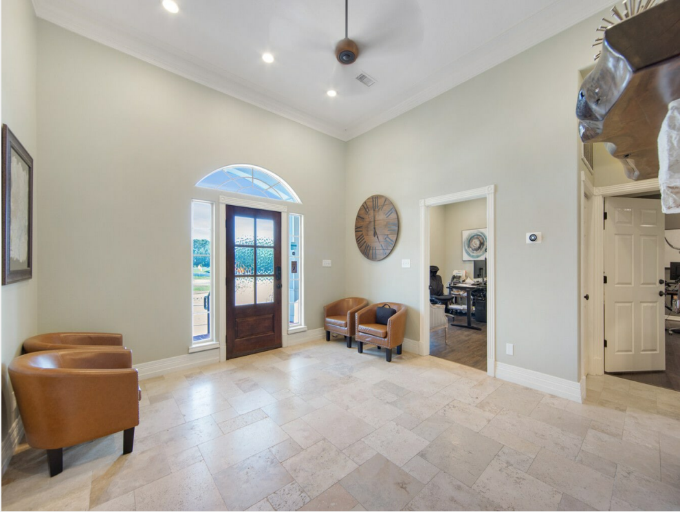
140 SH-19 N-23