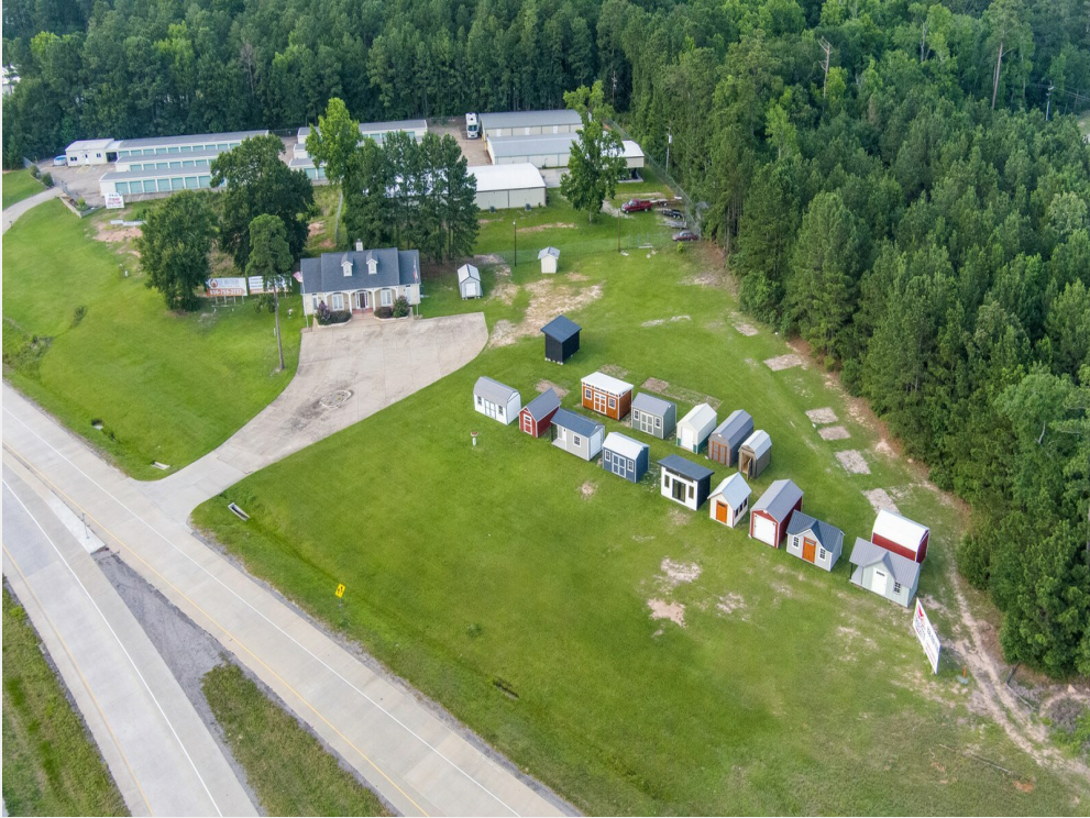
140 SH-19 N-4