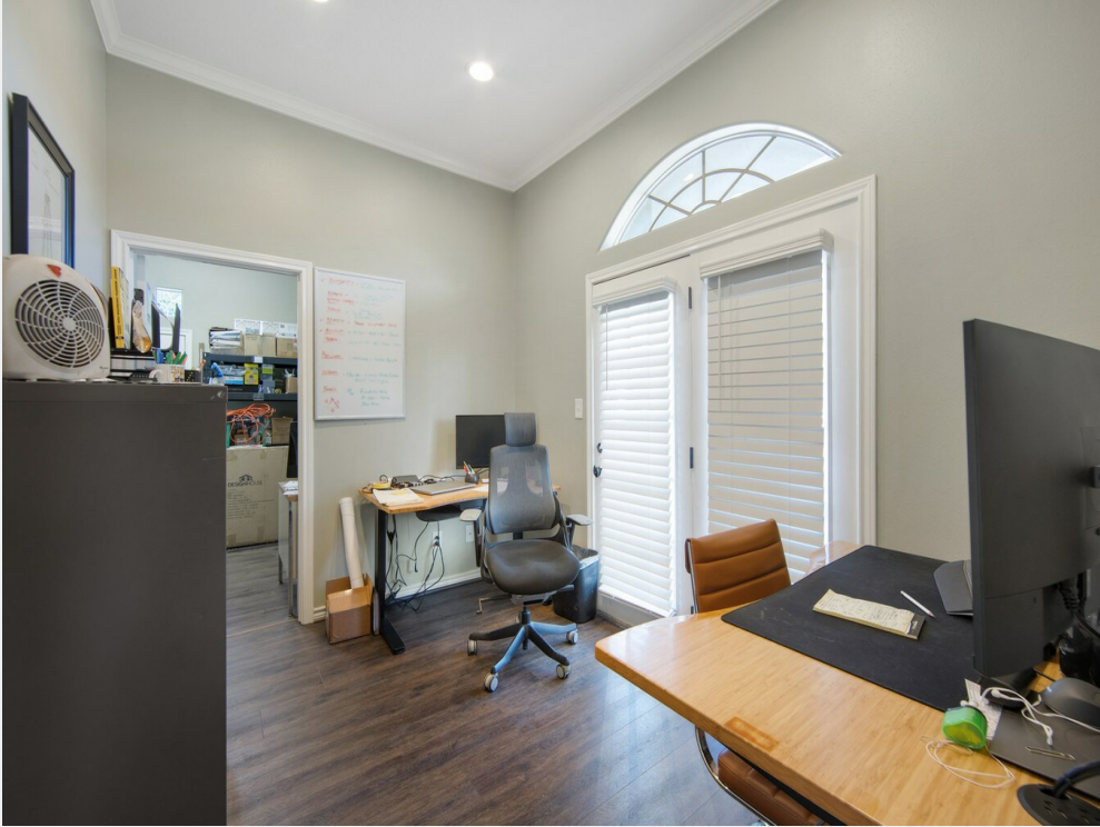
140 SH-19 N-19