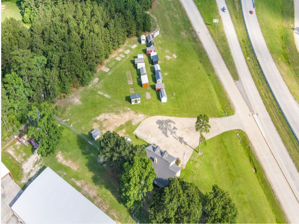
140 SH-19 N-9