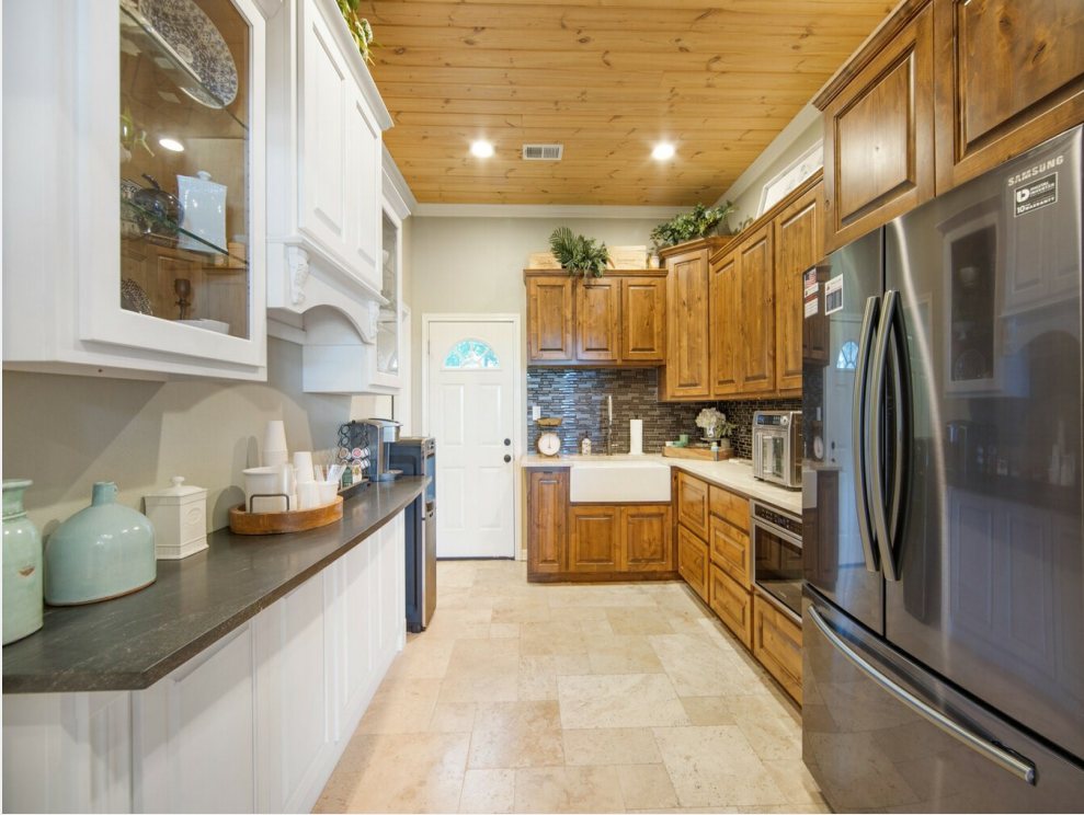
140 SH-19 N-30