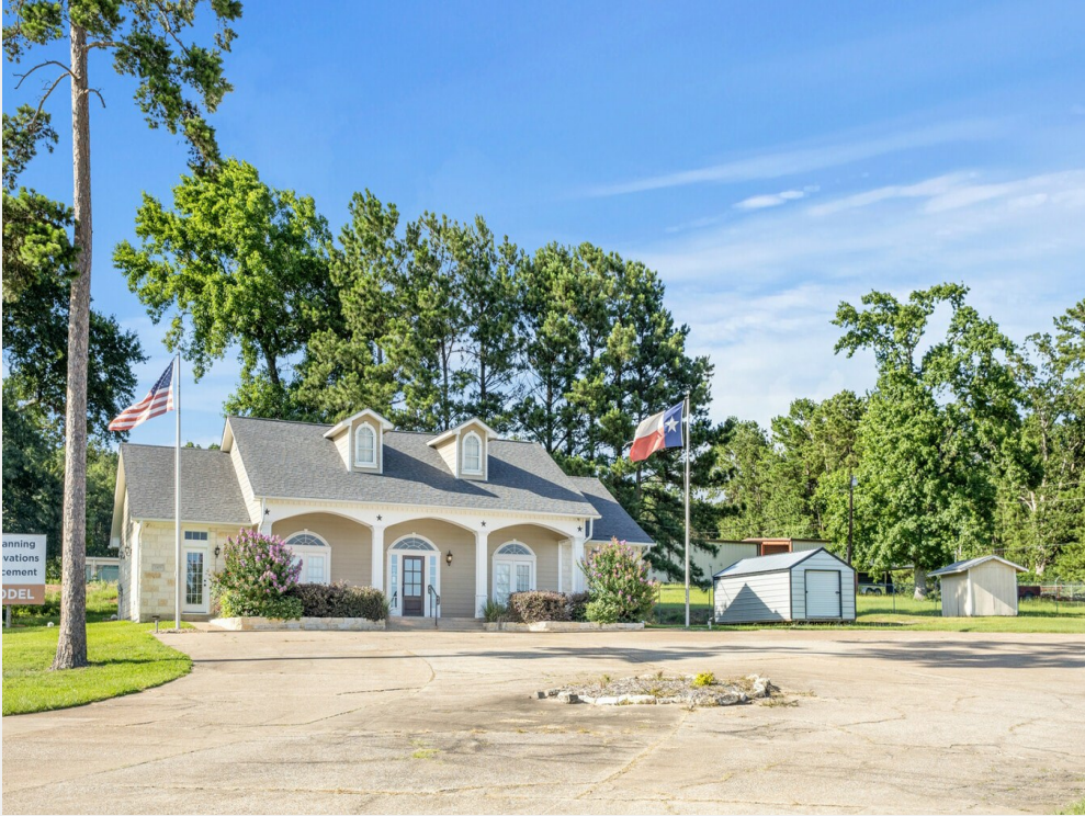
140 SH-19 N-16