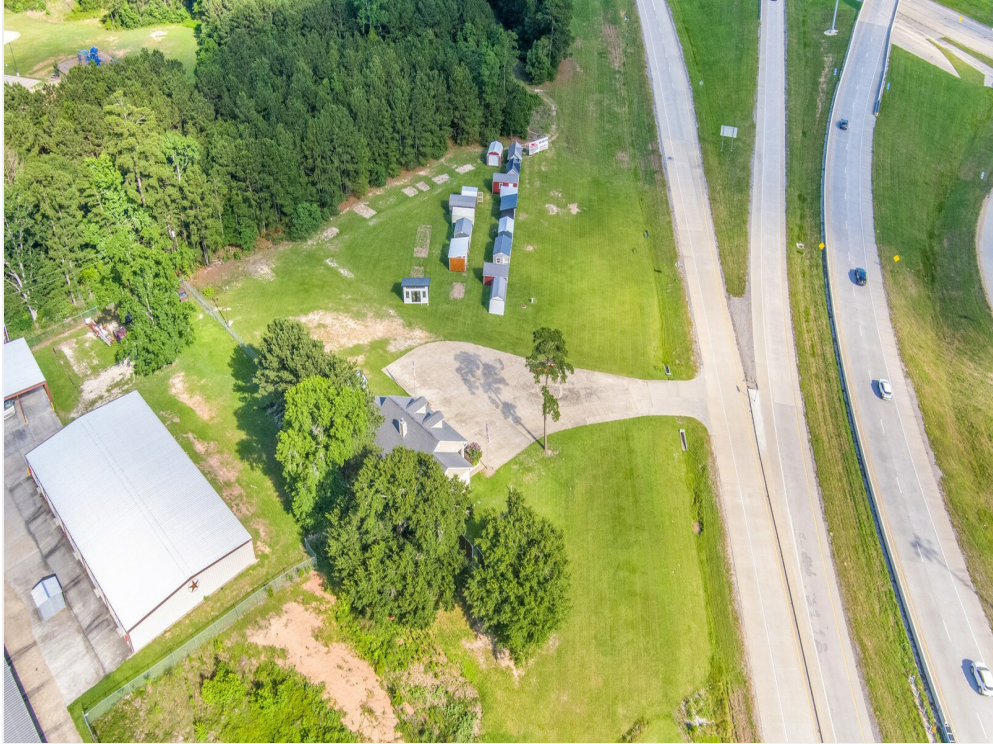
140 SH-19 N-10