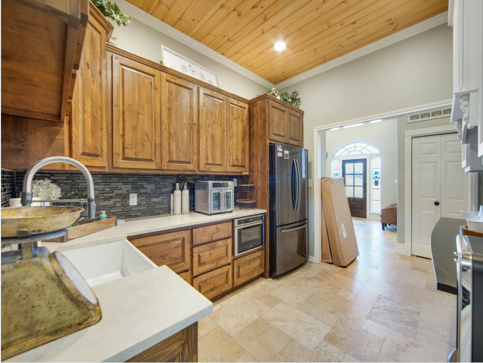
140 SH-19 N-29