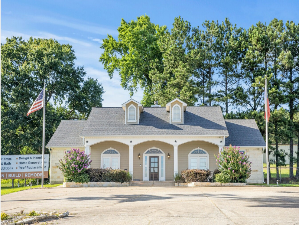
140 SH-19 N-15