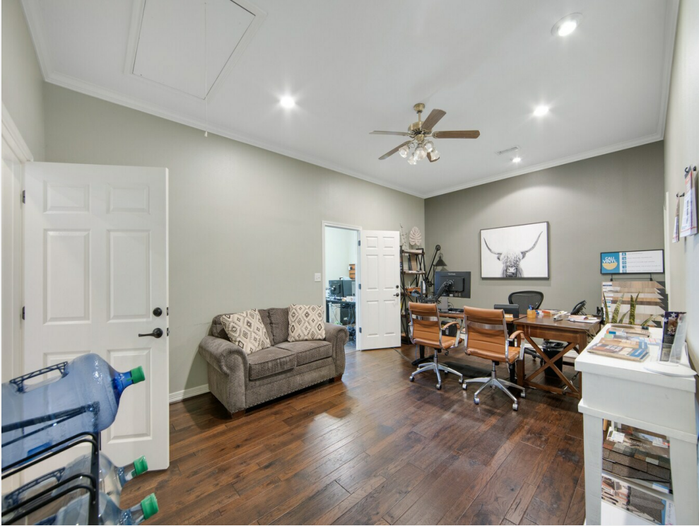
140 SH-19 N-26