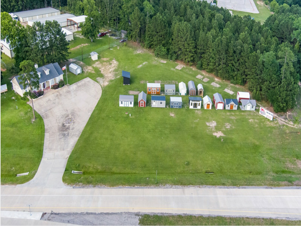
All storage buildings shown will be removed