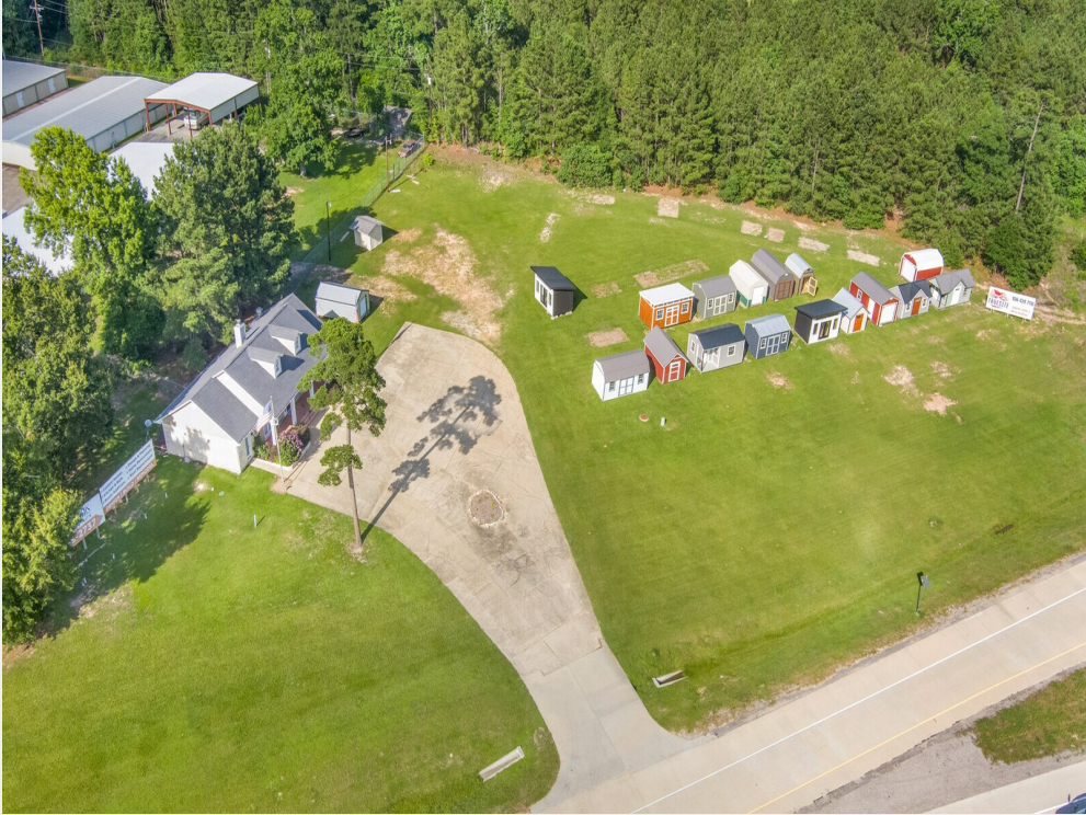
140 SH-19 N-11