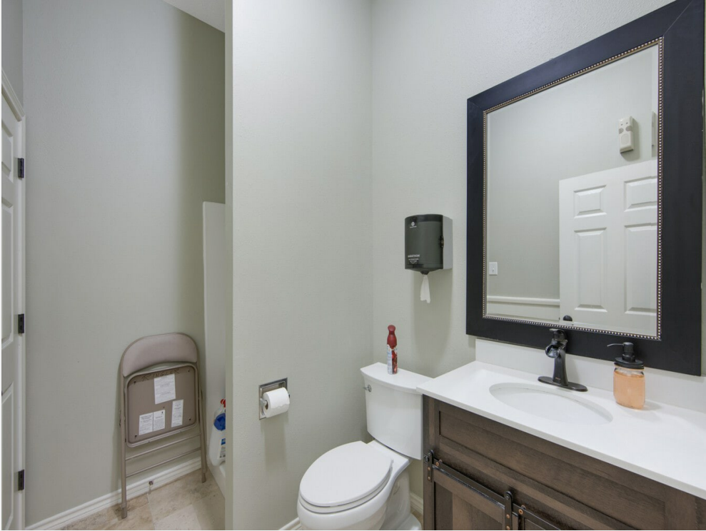
140 SH-19 N-28