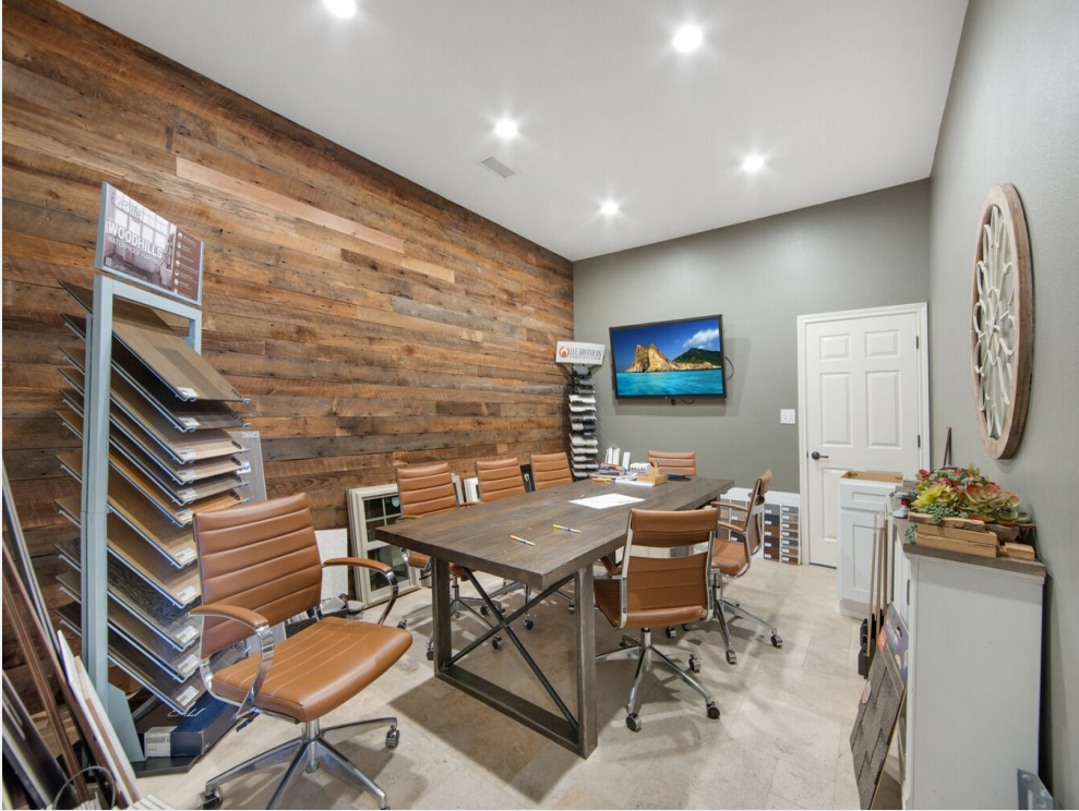
140 SH-19 N-21