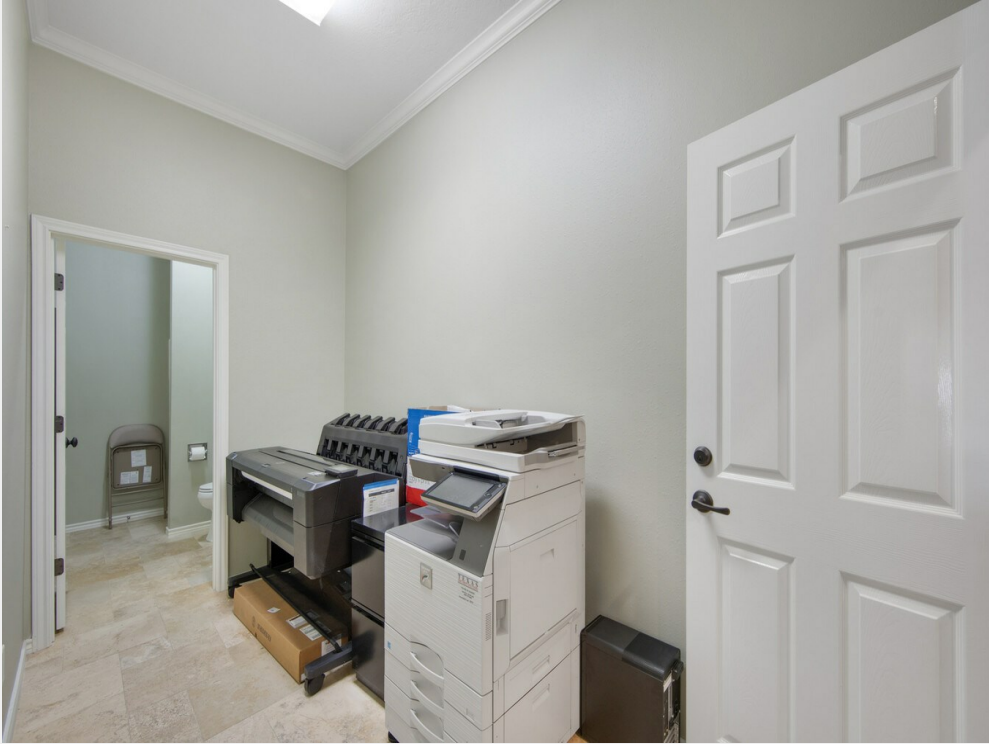
140 SH-19 N-27