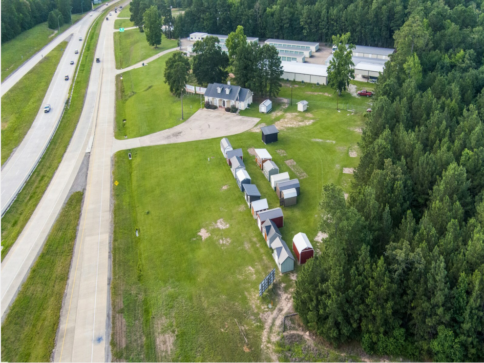
140 SH-19 N-5