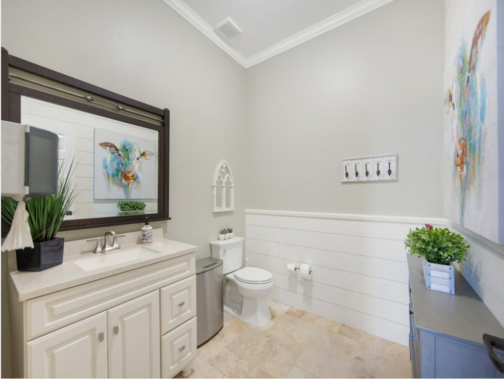
140 SH-19 N-22