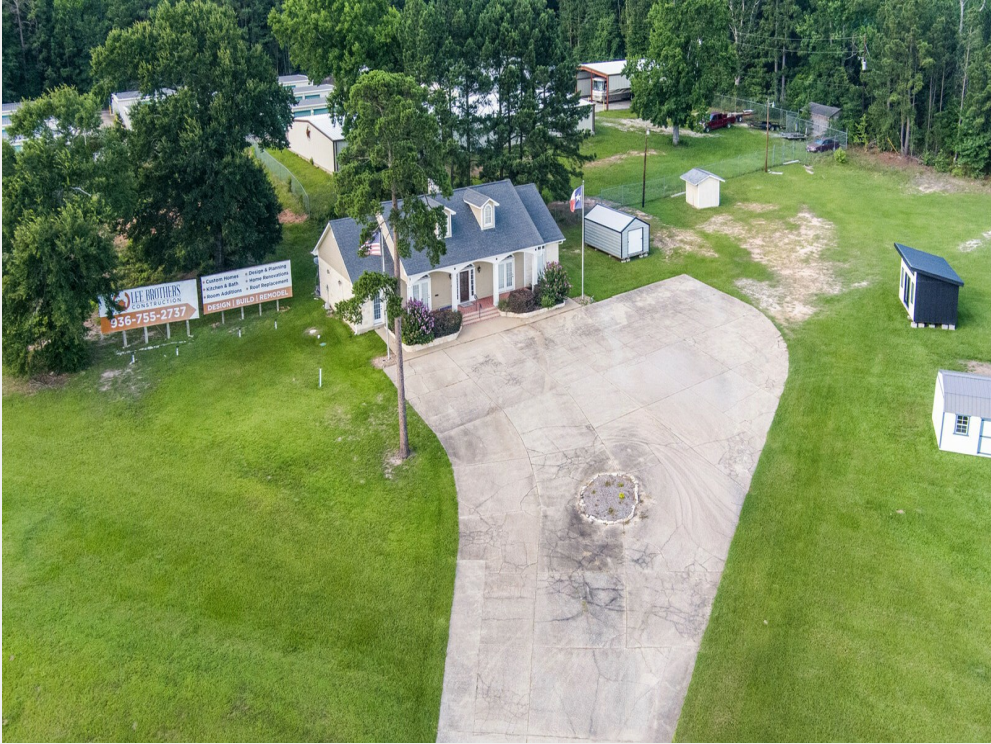
Office building with billboards