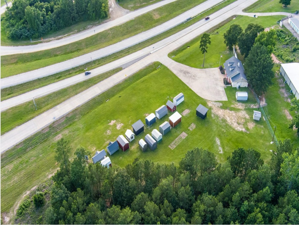
140 SH-19 N-7