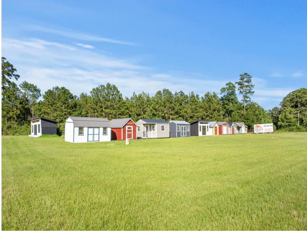
140 SH-19 N-17