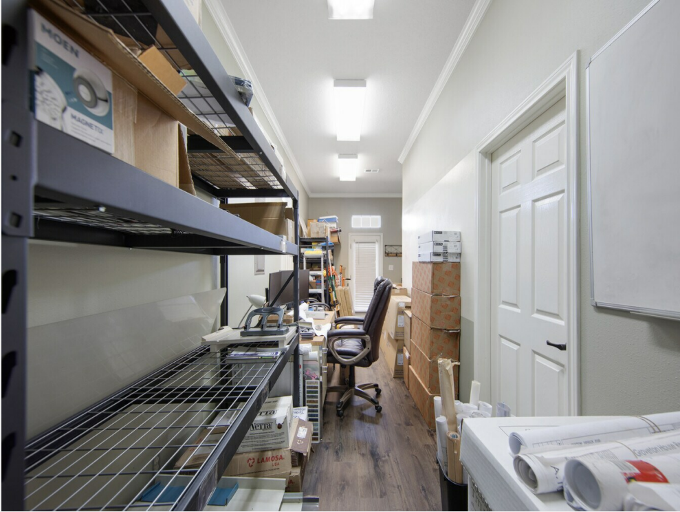
140 SH-19 N-20