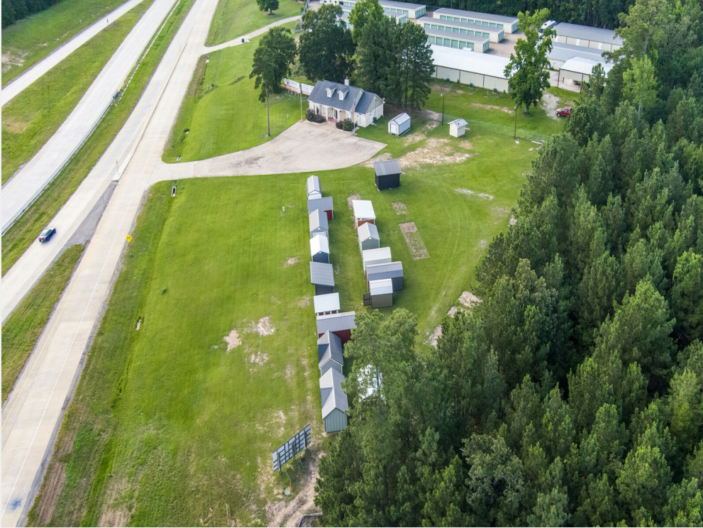
140 SH-19 N-6