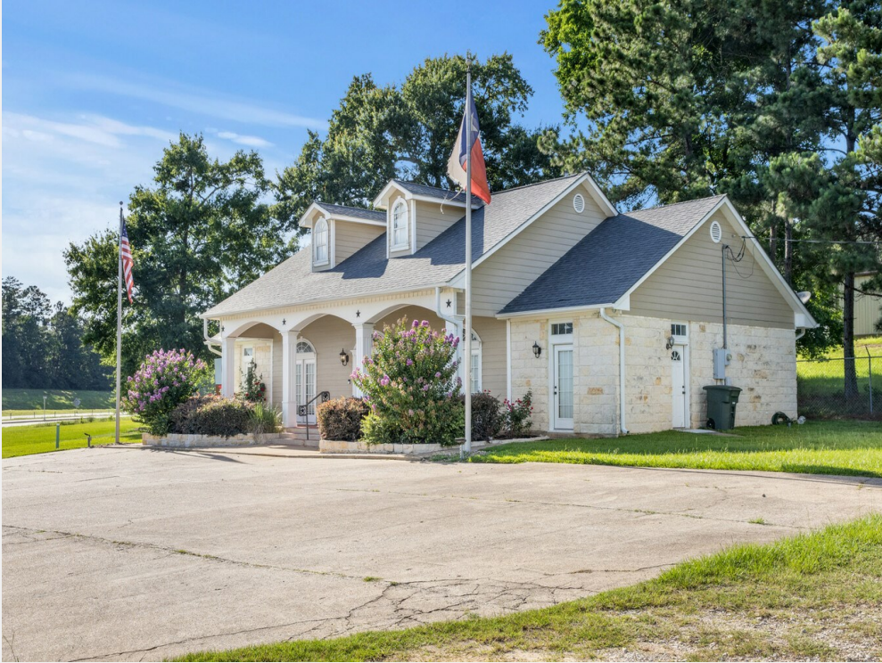
140 SH-19 N-13