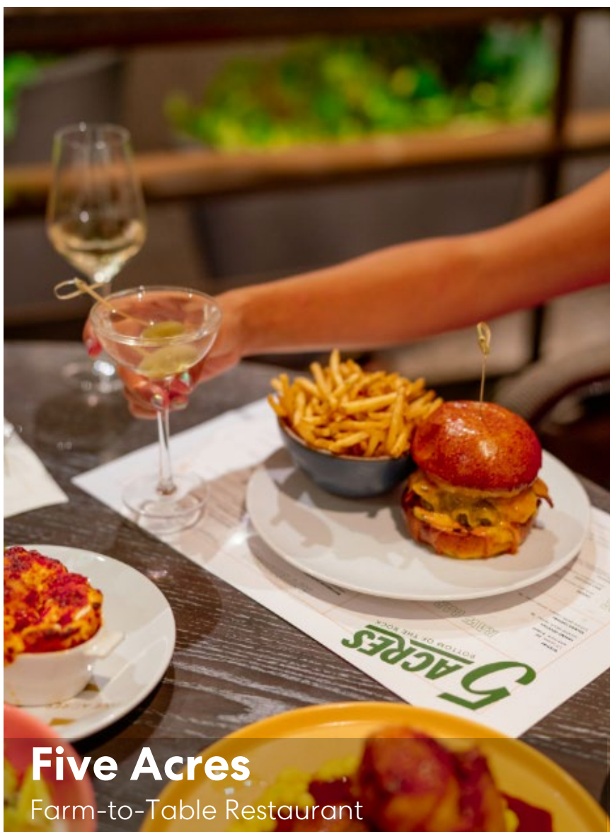
Five Acres Farm-to-Table Restaurant