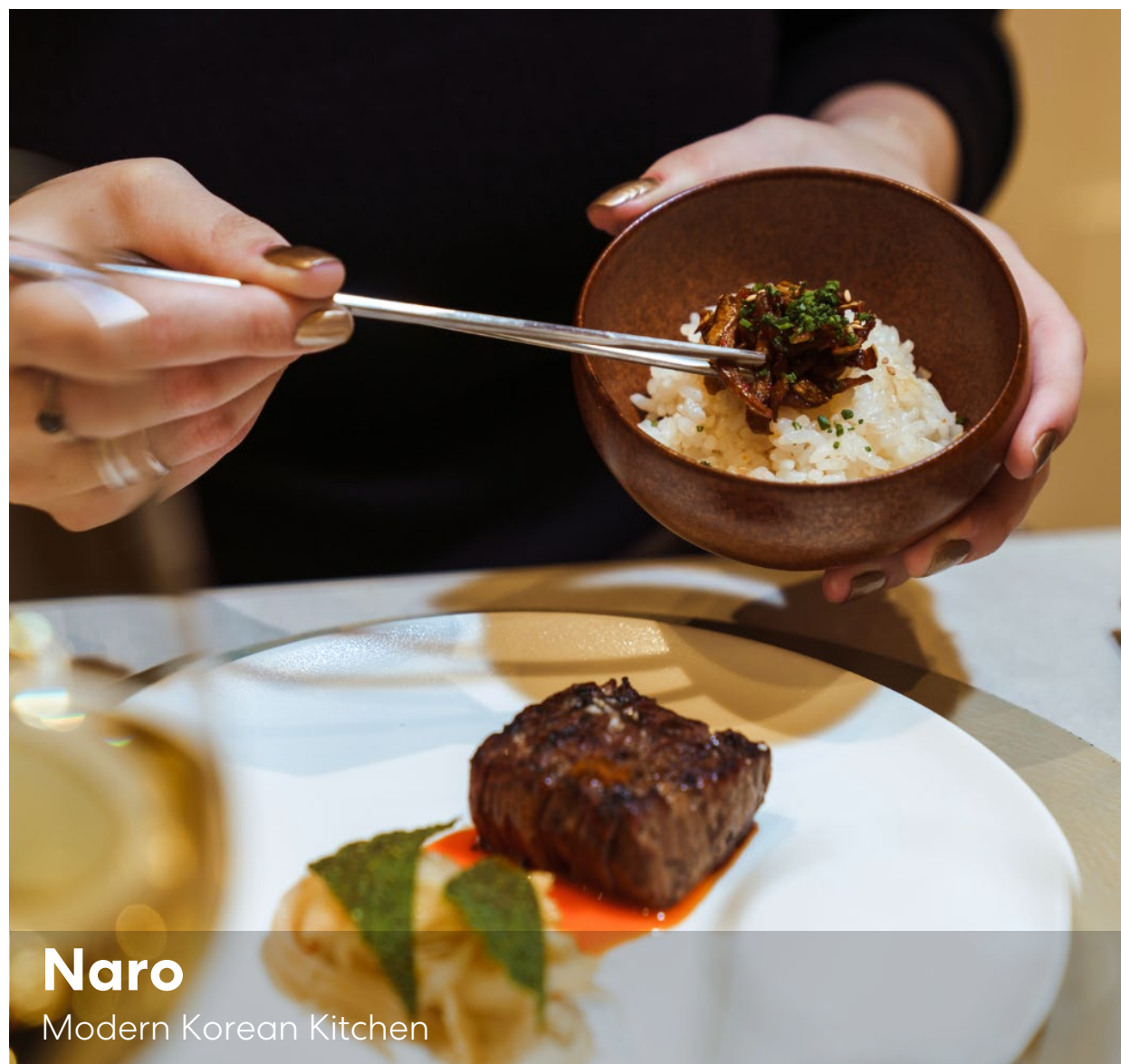
Naro Modern Korean Kitchen