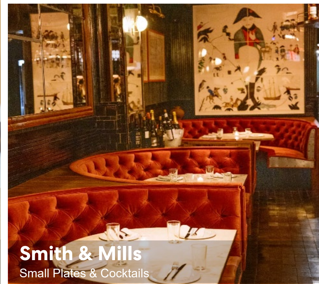
Smith & Mills Small Plates & Cocktails