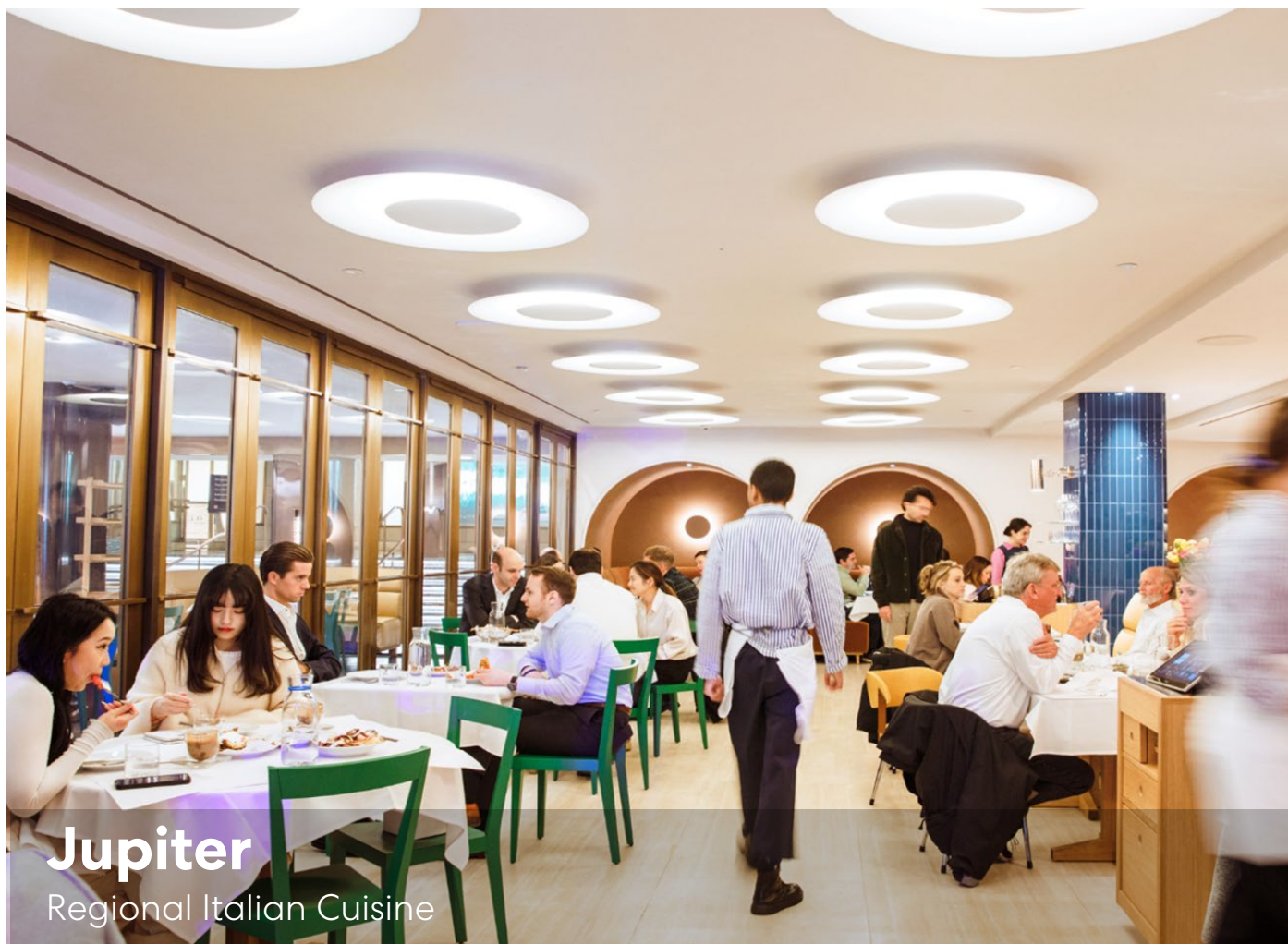
Jupiter Regional Italian Cuisine