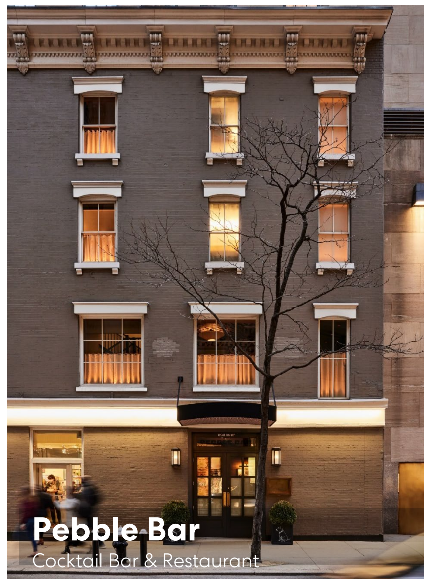
Pebble Bar Cocktail Bar & Restaurant