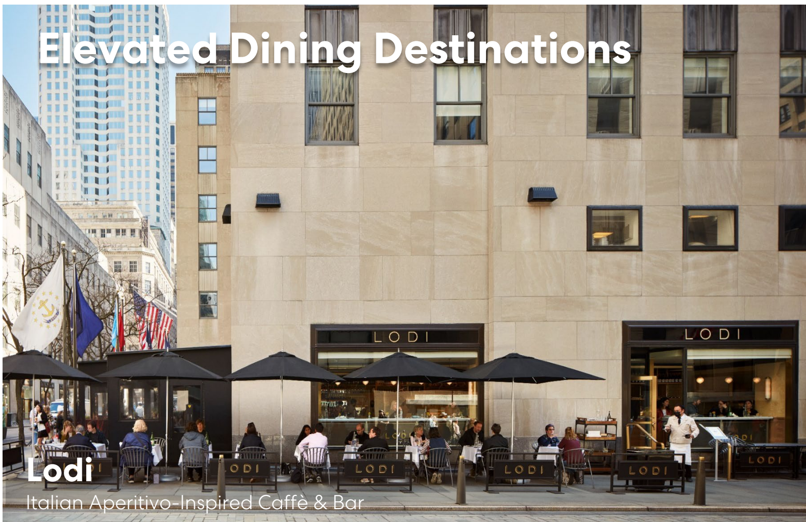
Lodi Italian Aperitivo-Inspired Caffè & Bar