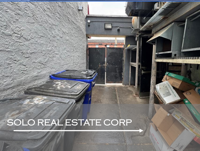
SOLO REAL ESTATE CORP